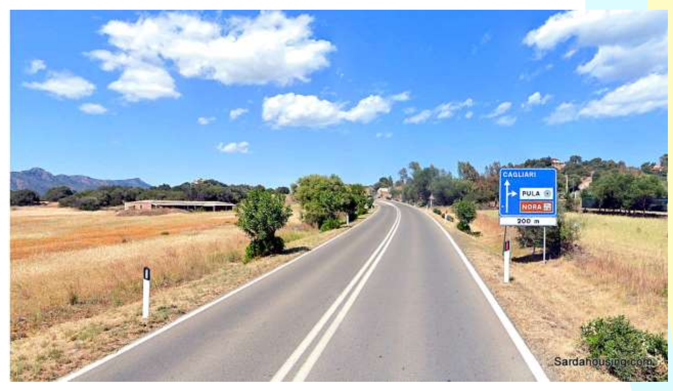
15 - Pula – Land Sulcitana