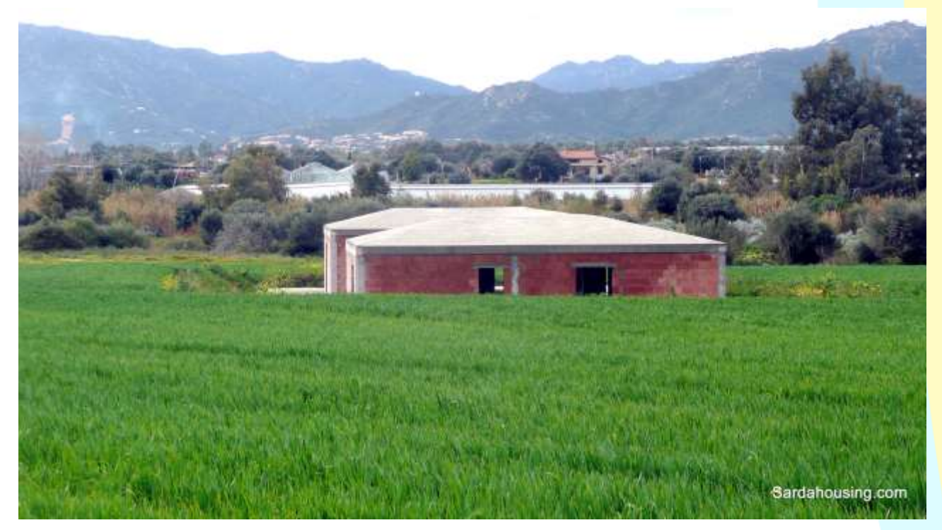
3 - Pula – Land Sulcitana: a building