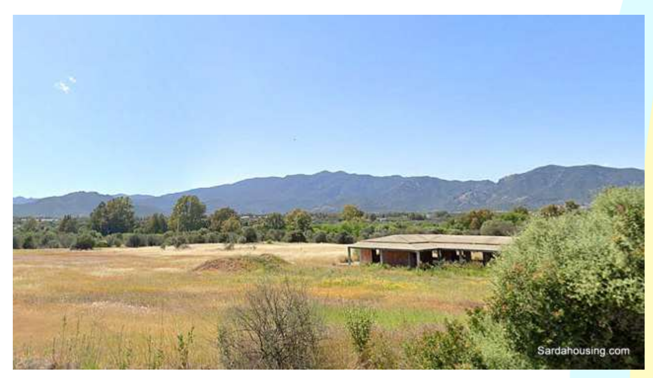
16 - Pula – Land Sulcitana: from googlegoogle