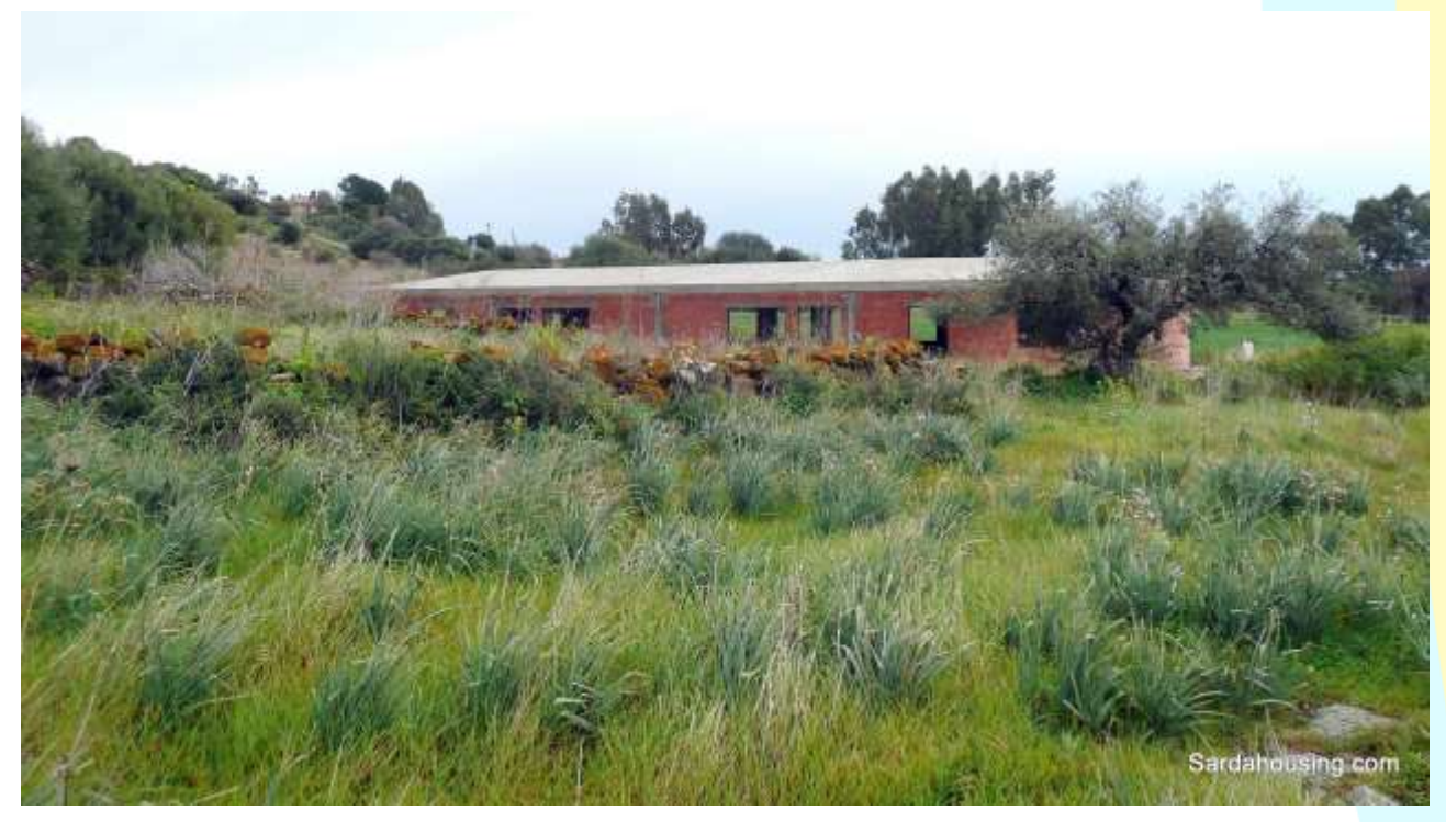
7 - Pula – Land Sulcitana: a building