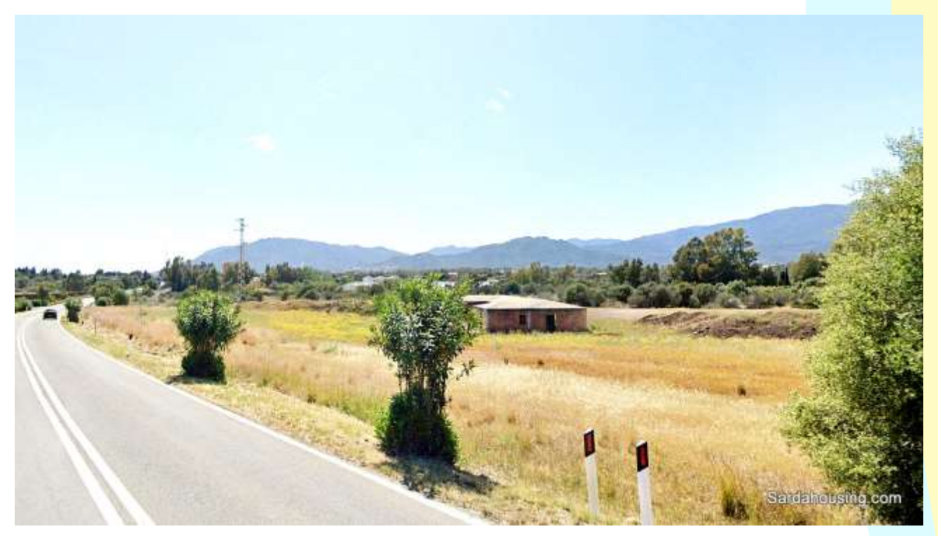
13 - Pula – Land Sulcitana