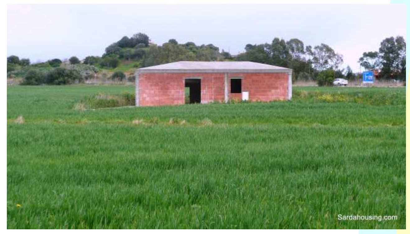
4 - Pula – Land Sulcitana: a building