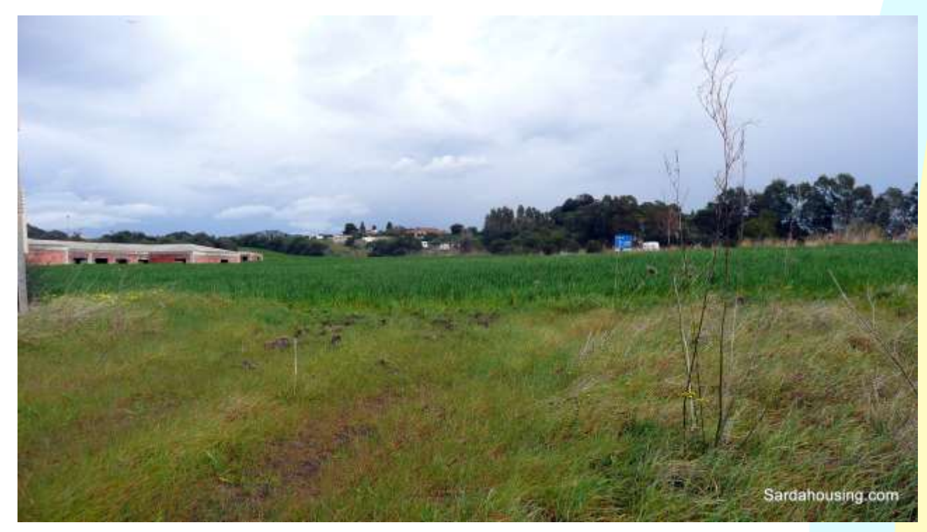
8 - Pula – Land Sulcitana: a building