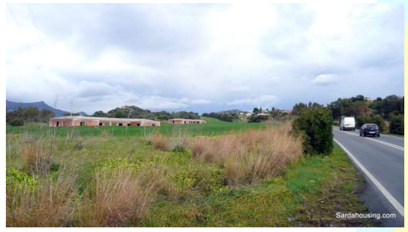
1 – Pula – Land Sulcitana: both buildings

At the entrance to the village of Pula , along the Strada Statale Sulcitana 195, we offer a large agricultural property with two unfinished buildings.