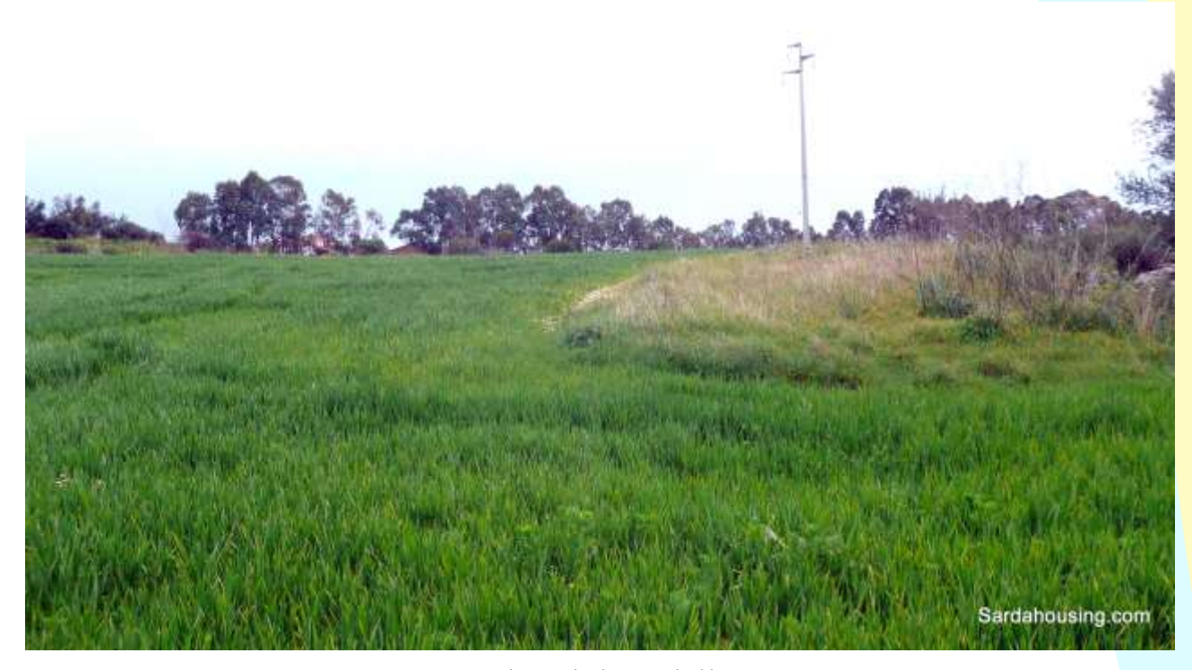
9 - Pula – Land Sulcitana: a building