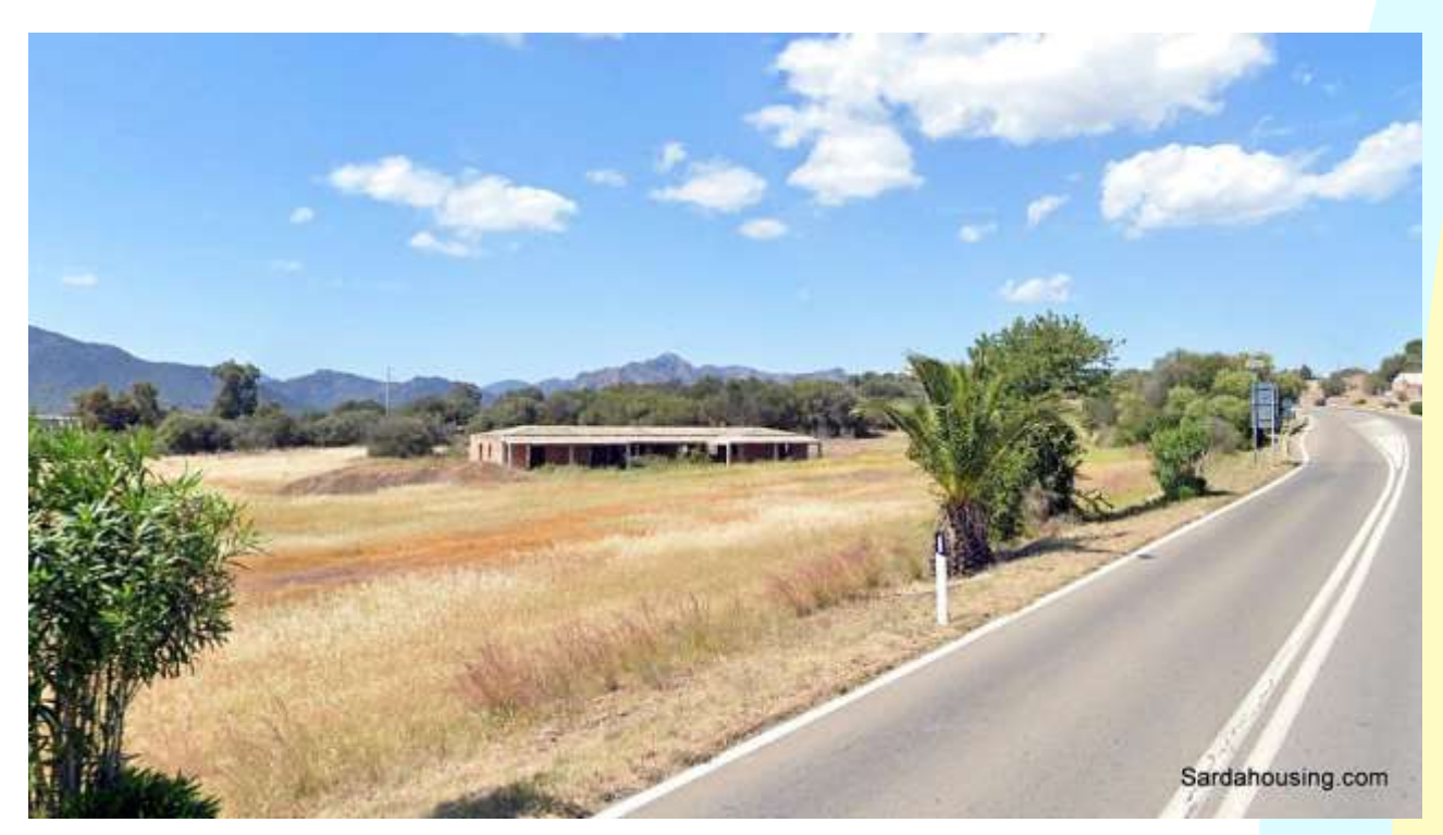
14 - Pula – Land Sulcitana