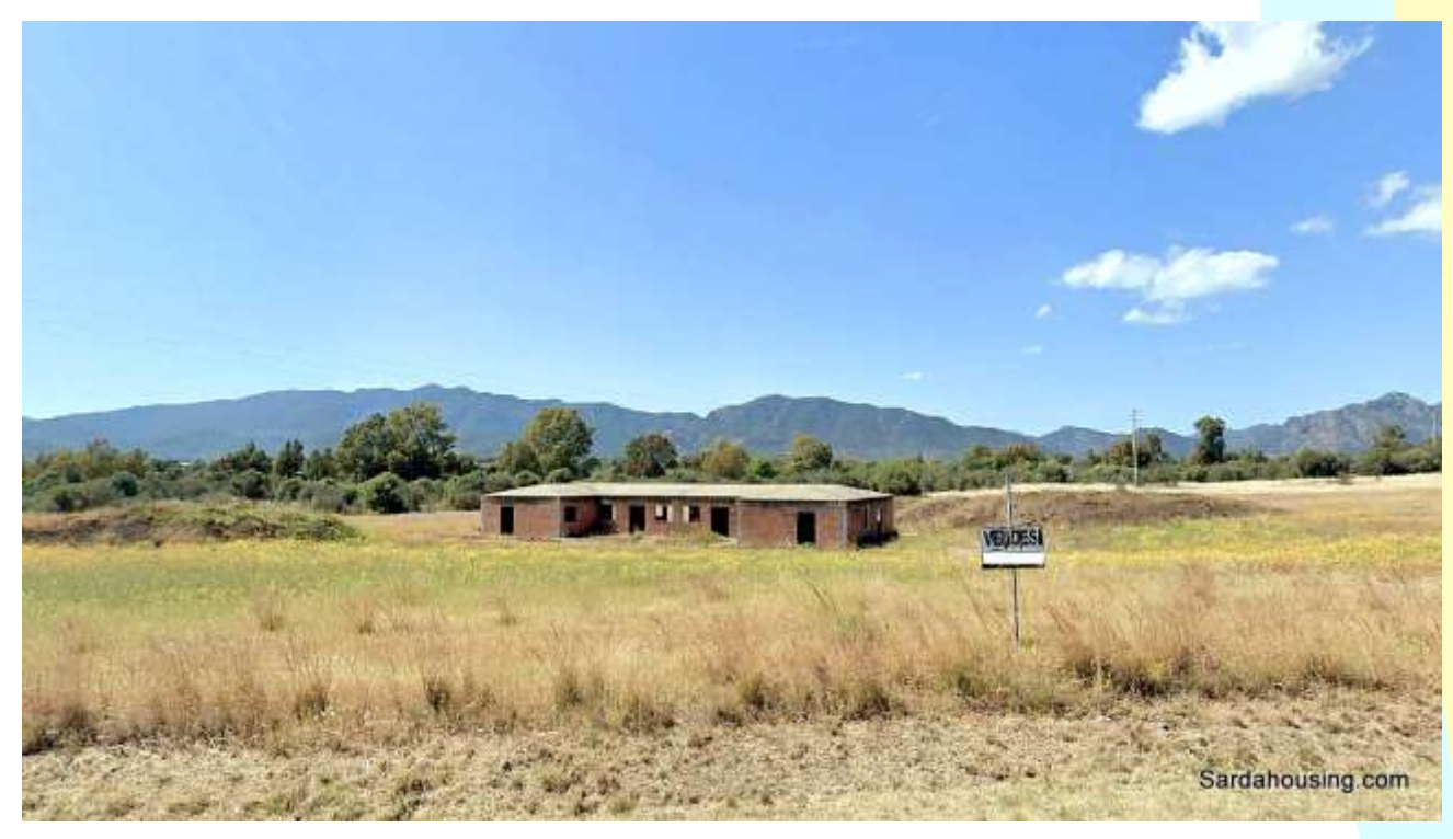
11 - Pula – Land Sulcitana