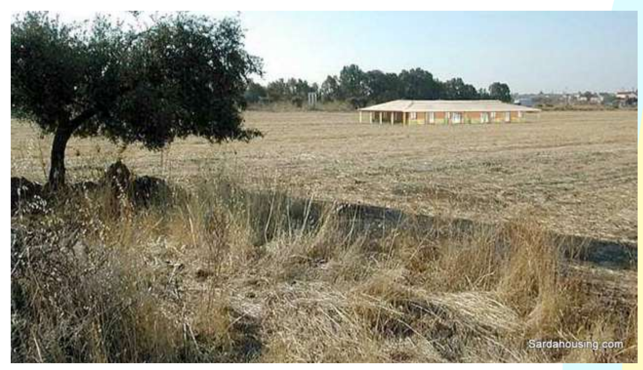
18 - Pula - Land Sulcitana: rendering