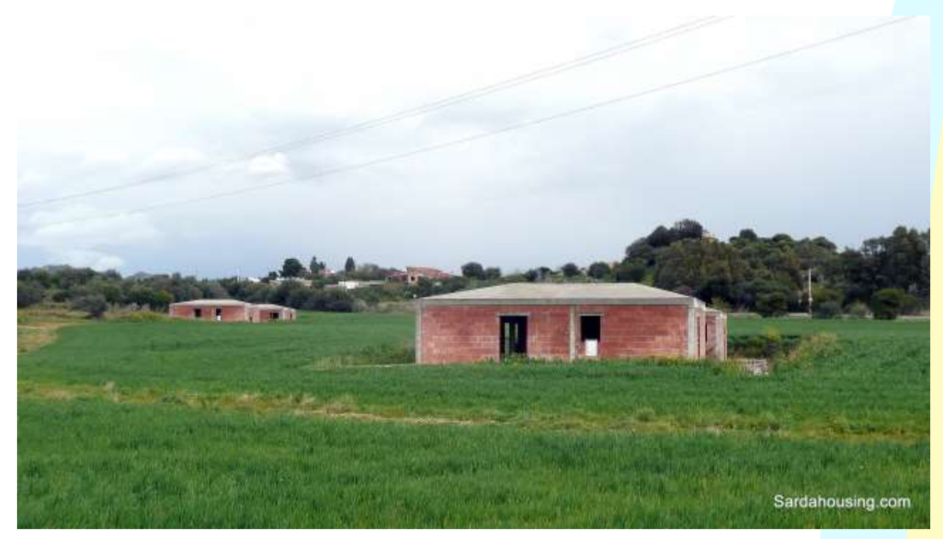
2 – Pula – Land Sulcitana: both buildings