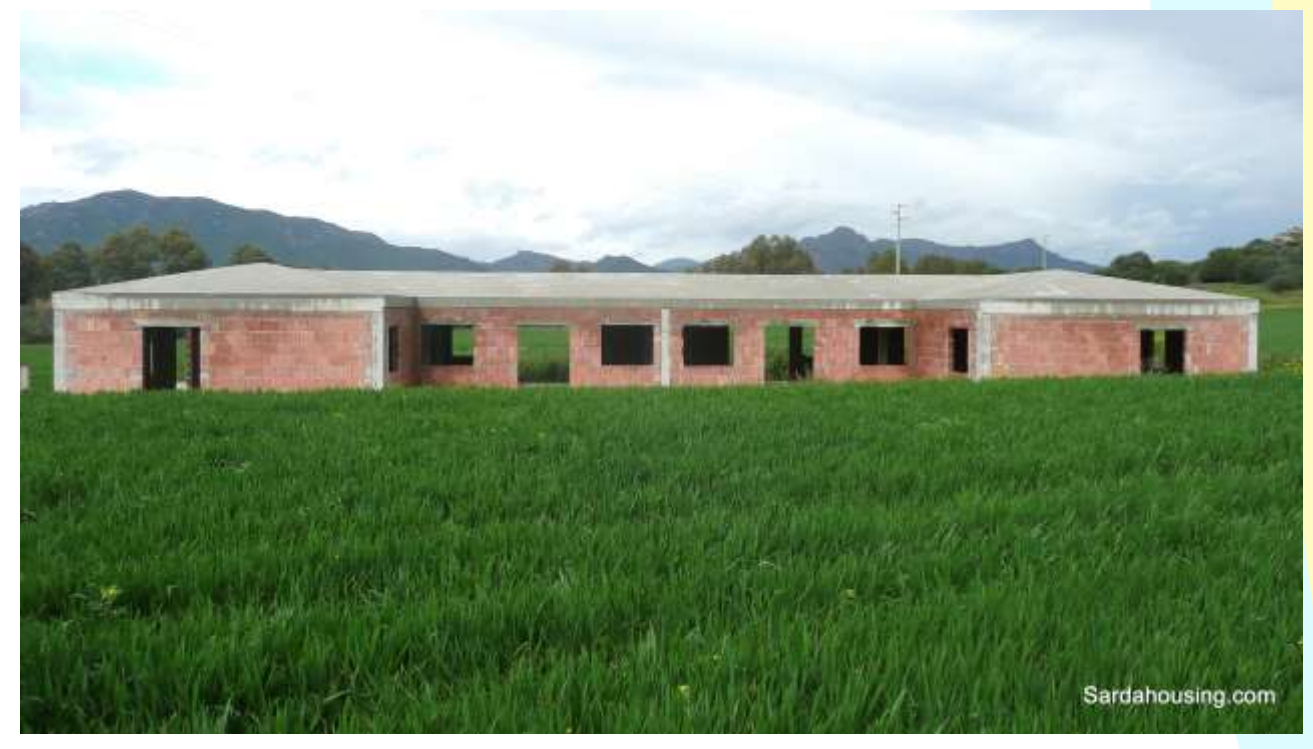
5 - Pula – Land Sulcitana: a building