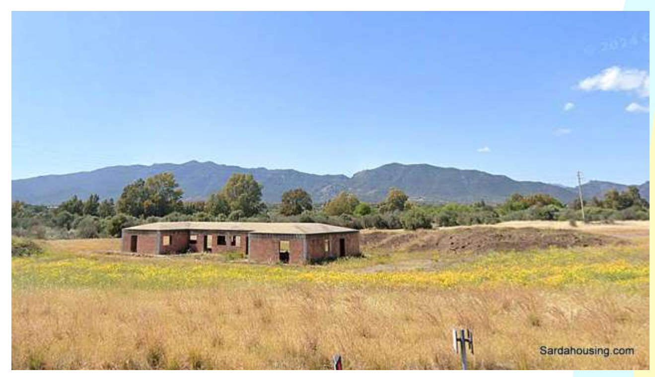
12 - Pula – Land Sulcitana