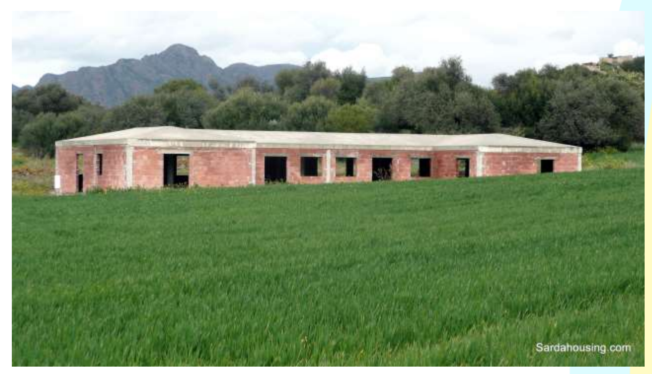
6 - Pula – Land Sulcitana: a building