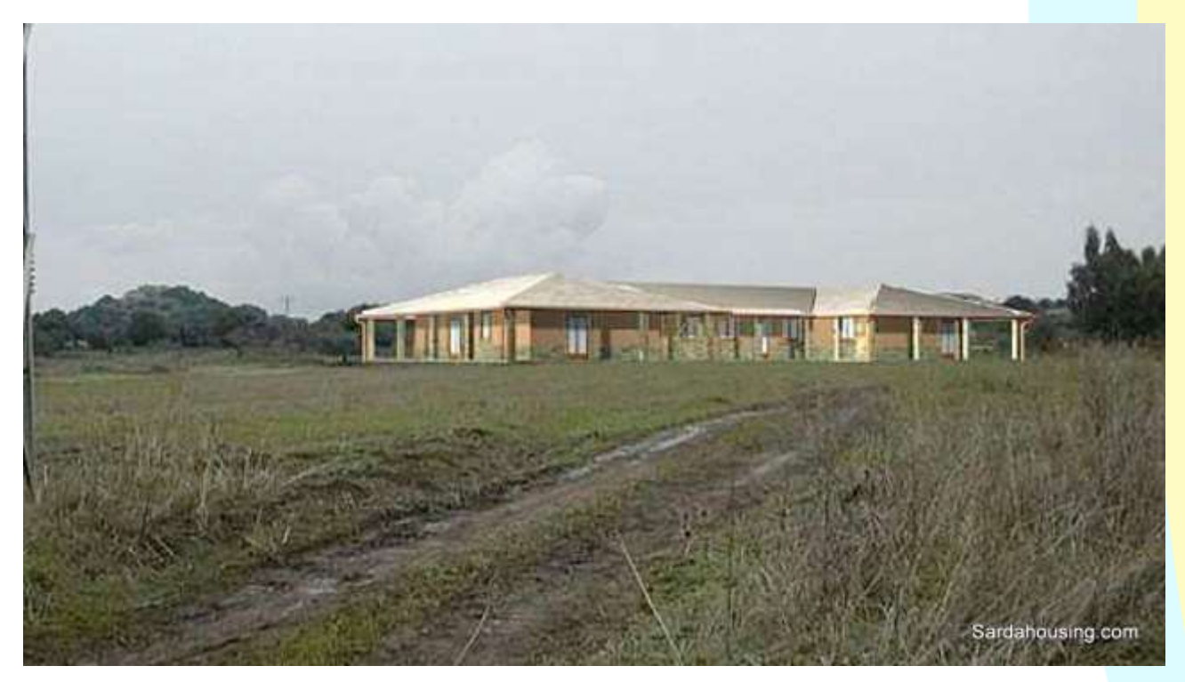
17 - Pula – Land Sulcitana: rendering