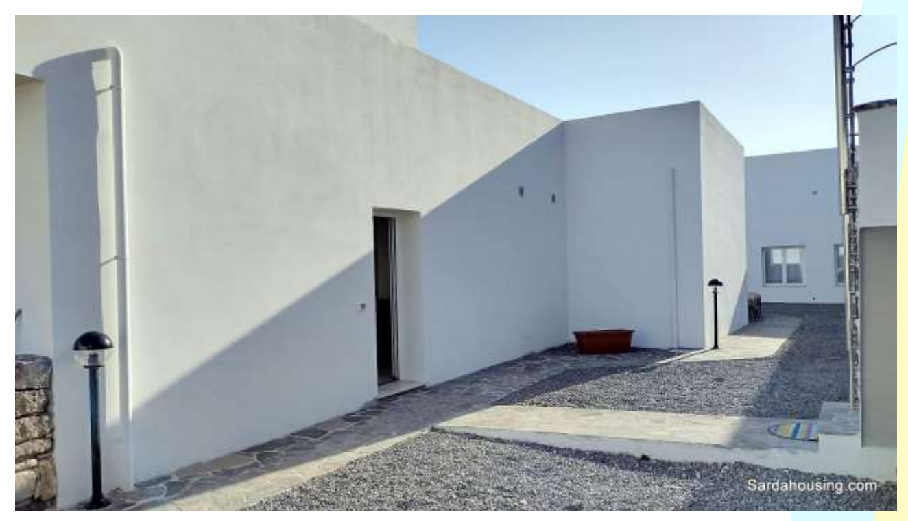
6 - Carloforte – Isola S. Pietro – Apartment Le Colonie