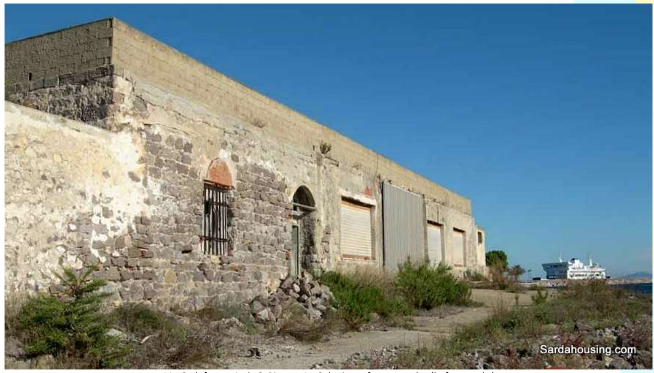
11 – Carloforte – Isola S. Pietro – Le Colonie seafront complex (before works)