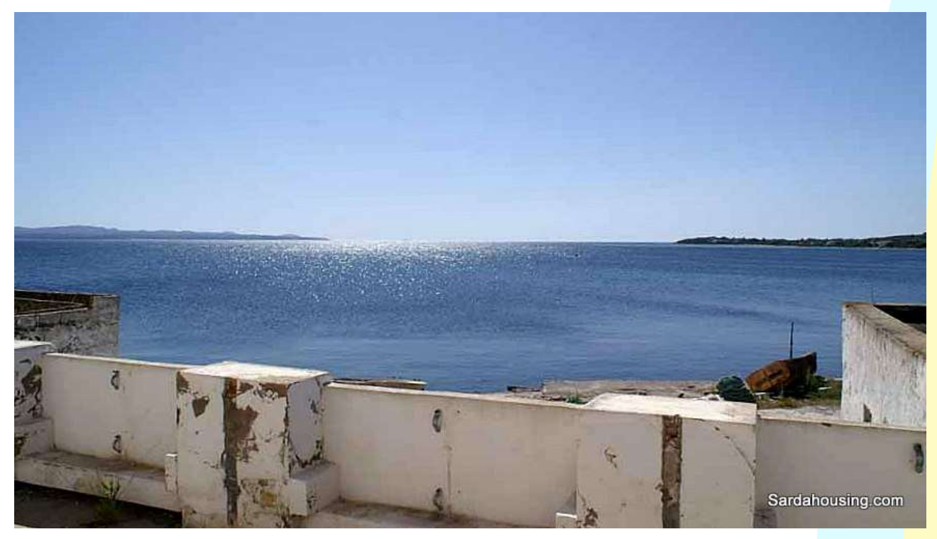
12 – Carloforte – Isola S. Pietro – Le Colonie seafront complex (before works)