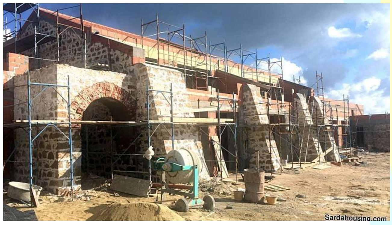
15 - Carloforte – Isola S. Pietro – Le Colonie seafront complex