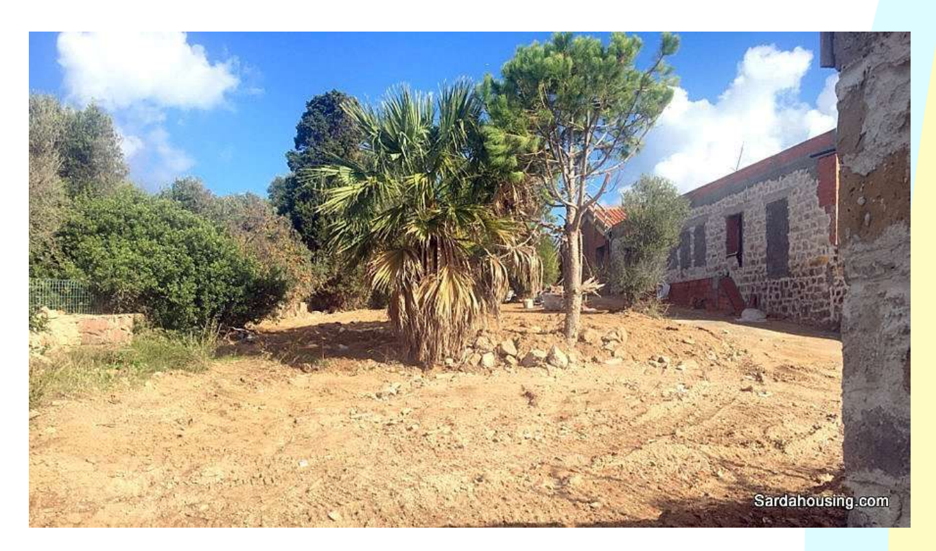
20 - Carloforte – Isola S. Pietro – Le Colonie seafront complex