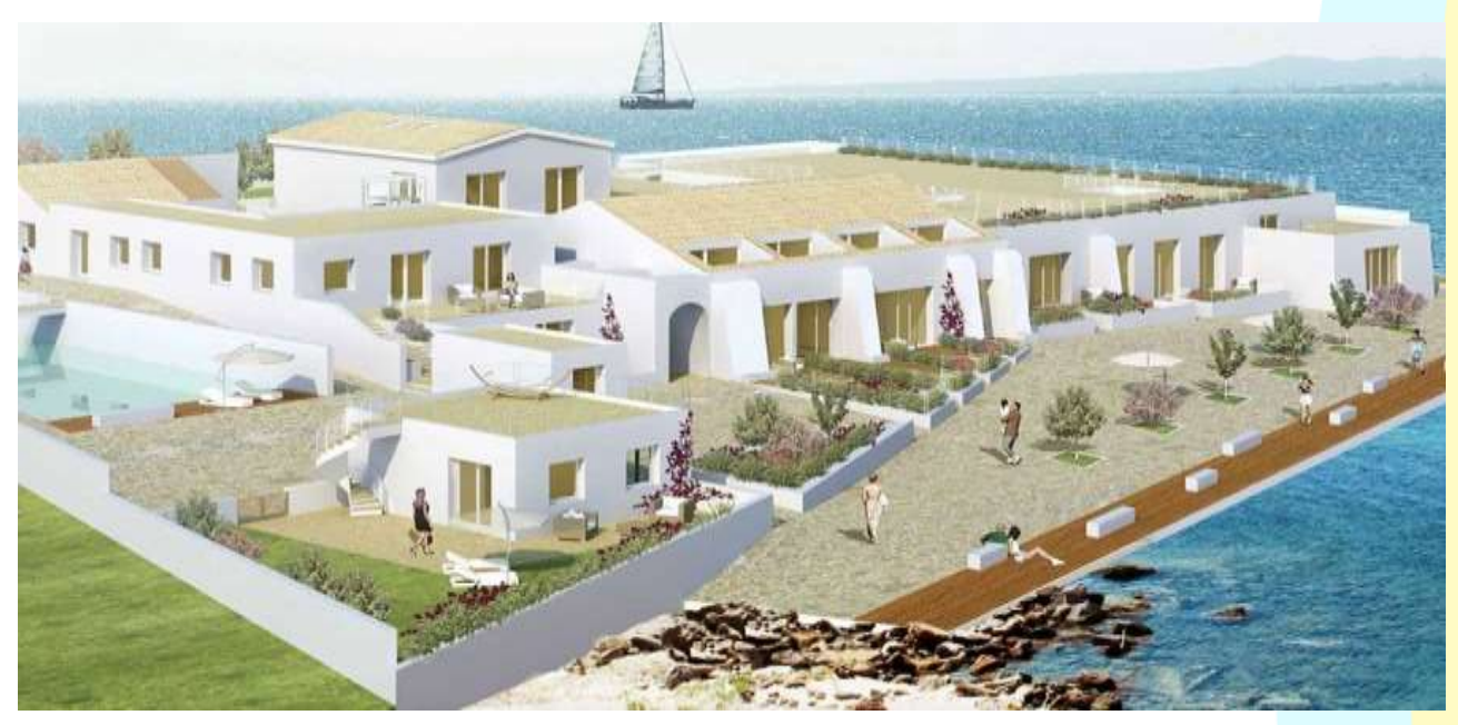
2 - Carloforte – Isola S. Pietro – Complex Le Colonie

info@sardahousing.com - www.sardahousing.com