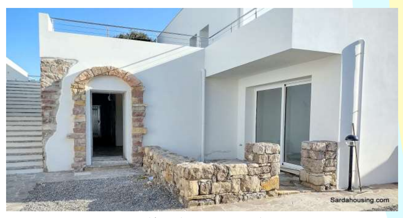
3 - Carloforte – Isola S. Pietro – Apartment Le Colonie