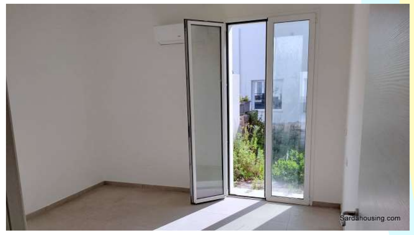
7 - Carloforte – Isola S. Pietro – Apartment Le Colonie