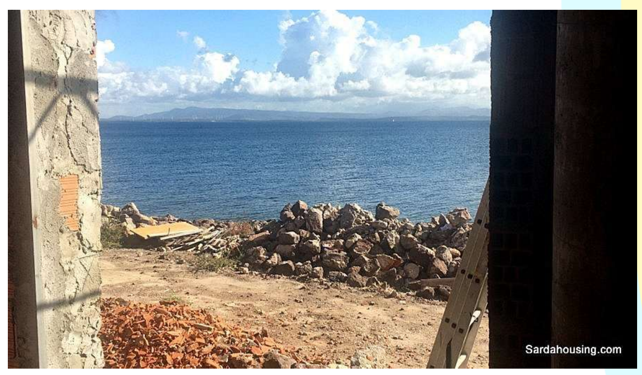
19 - Carloforte – Isola S. Pietro – Le Colonie seafront complex