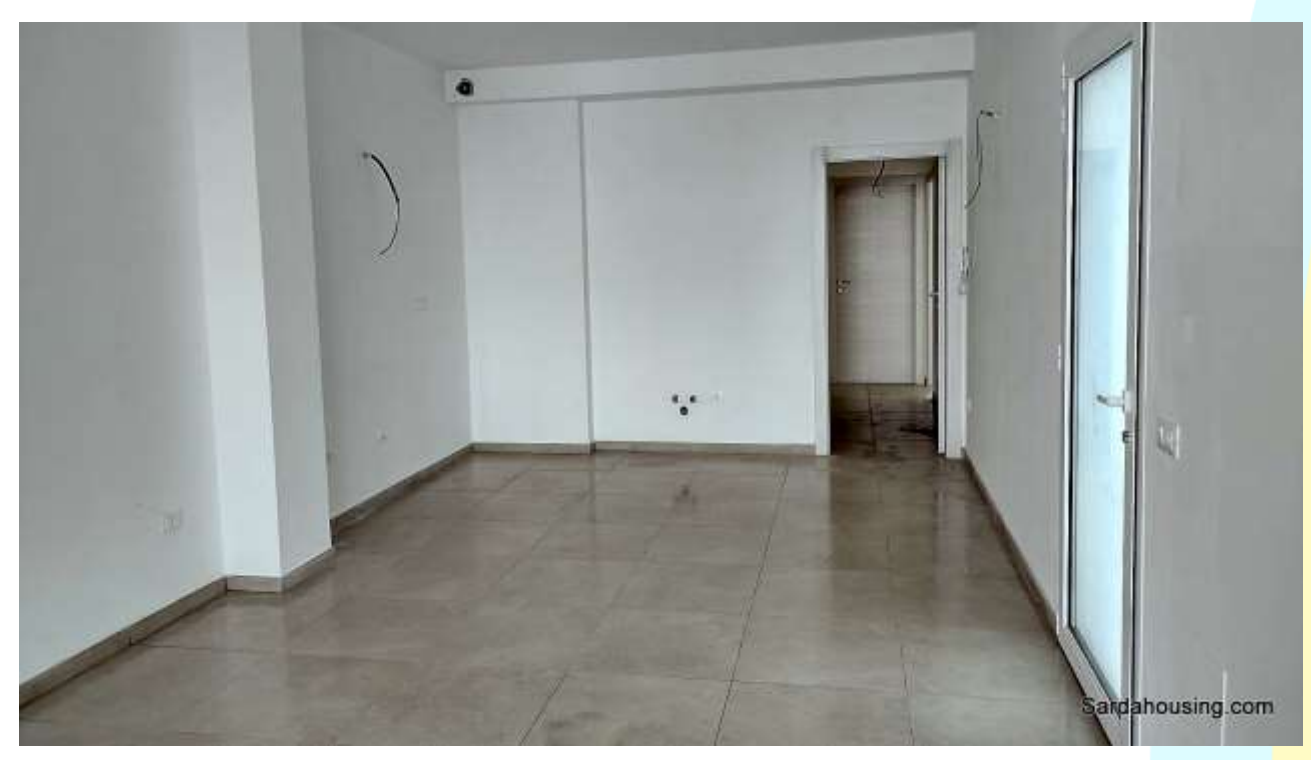
8 - Carloforte – Isola S. Pietro – Apartment Le Colonie