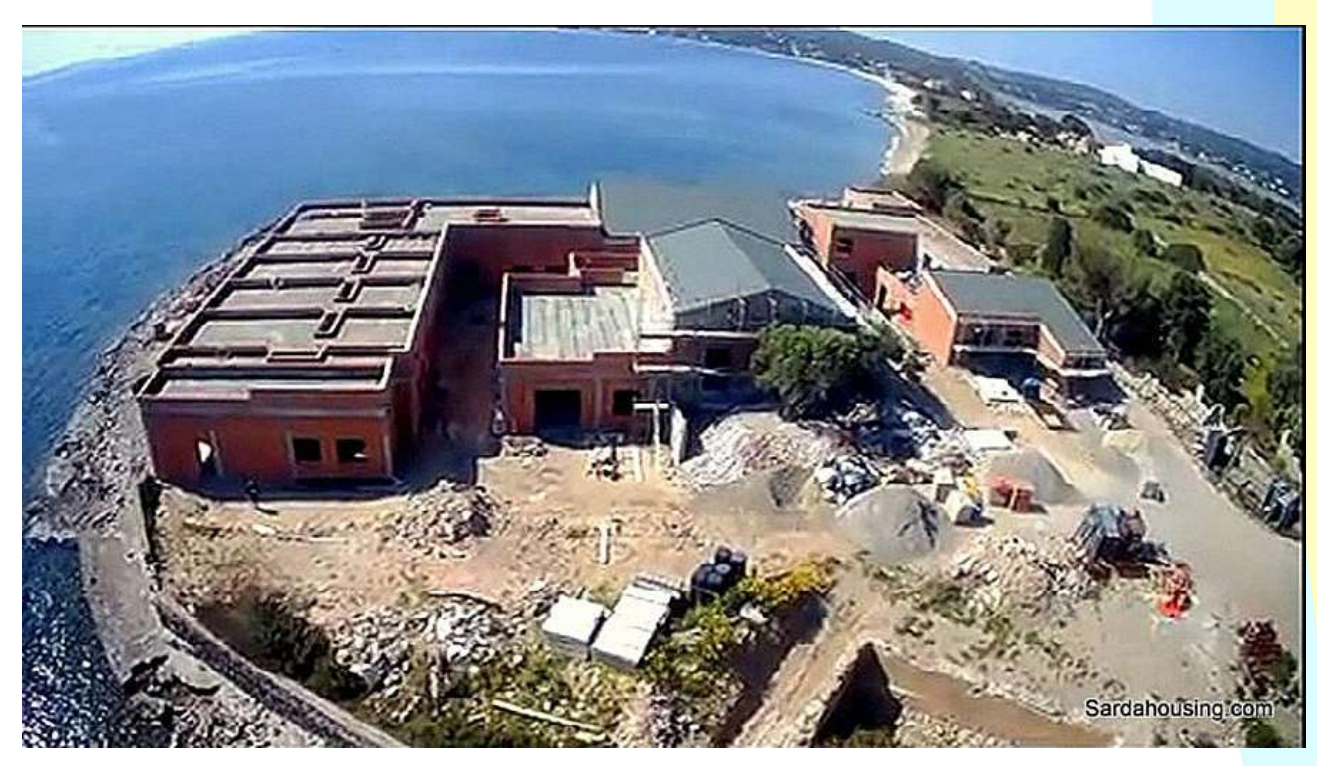
13 - Carloforte – Isola S. Pietro – Le Colonie seafront complex