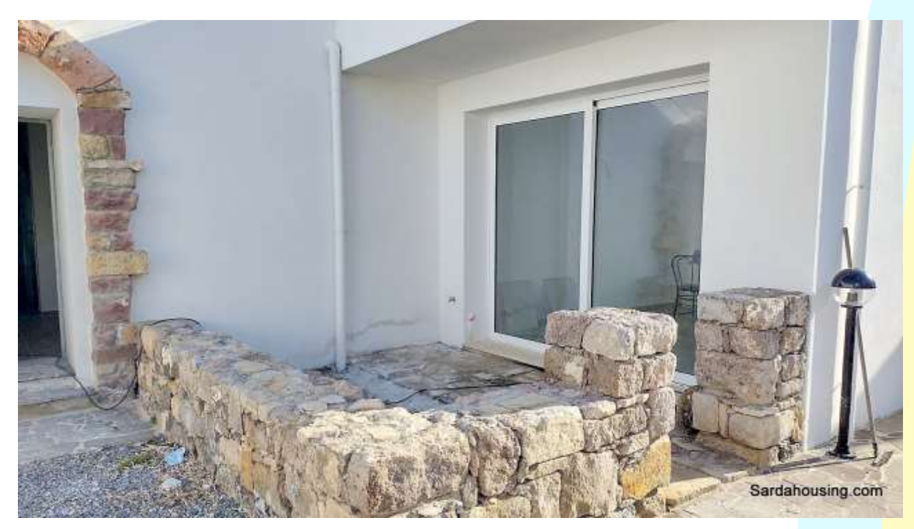
4 - Carloforte – Isola S. Pietro – Apartment Le Colonie