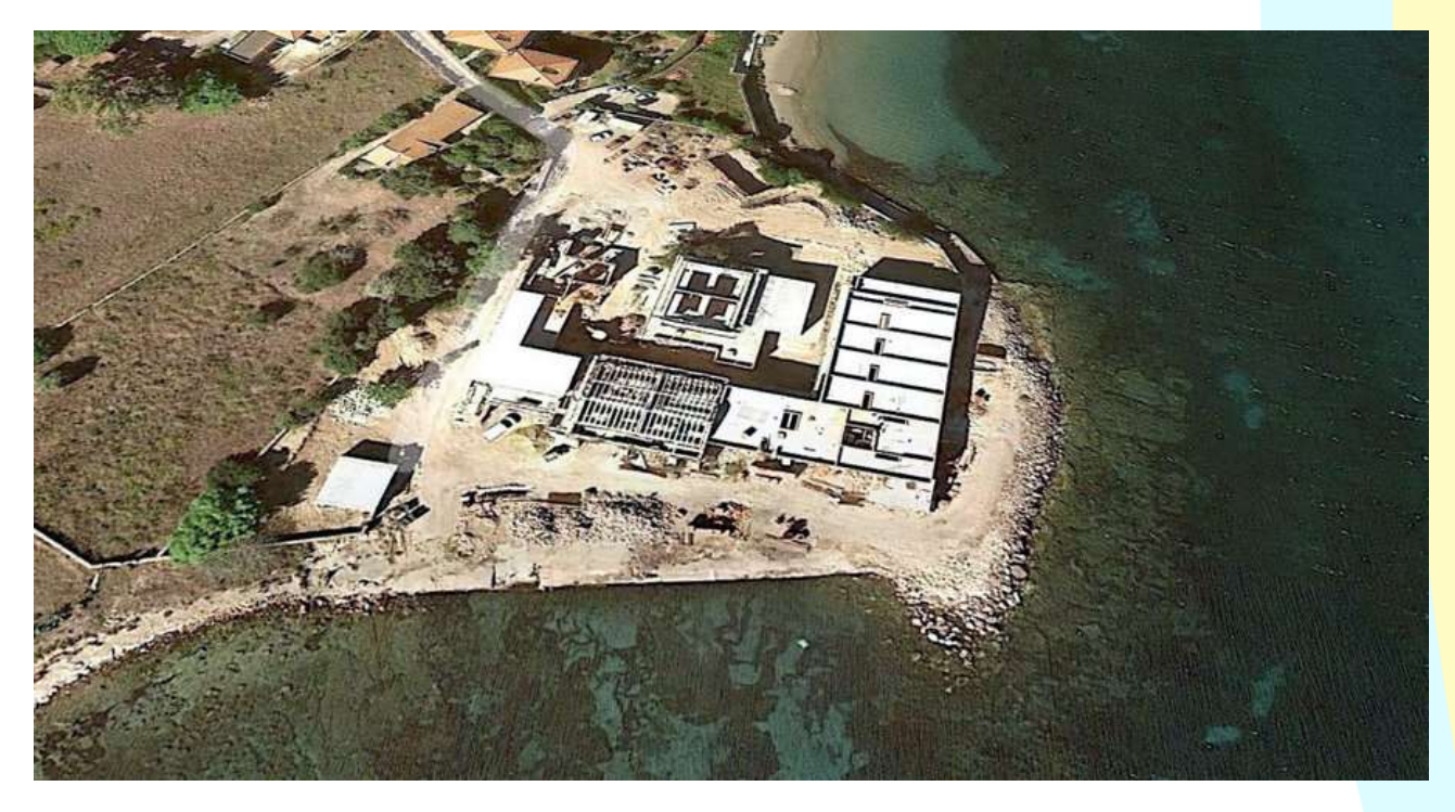
29 - Carloforte – Isola S. Pietro – Le Colonie seafront complex