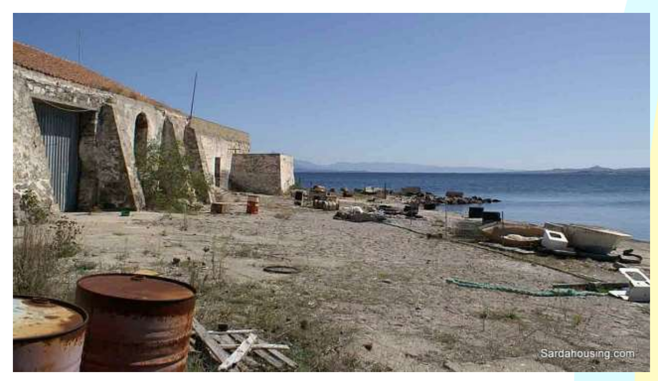
10– Carloforte – Isola S. Pietro – Le Colonie seafront complex (before works)