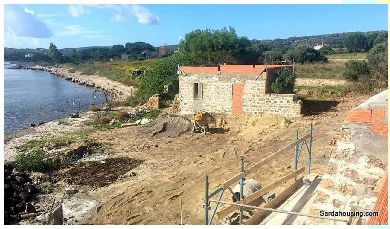
17 - Carloforte – Isola S. Pietro – Le Colonie seafront complex