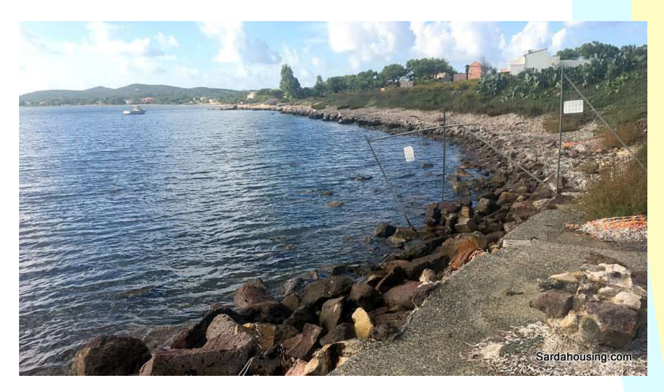
23 - Carloforte – Isola S. Pietro – Le Colonie seafront complex