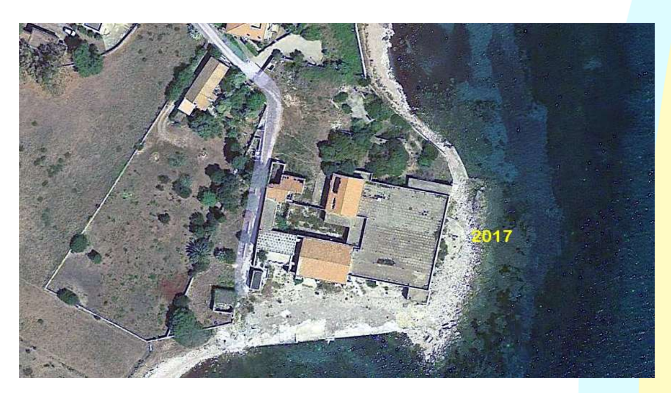
28 - Carloforte – Isola S. Pietro – Le Colonie seafront complex