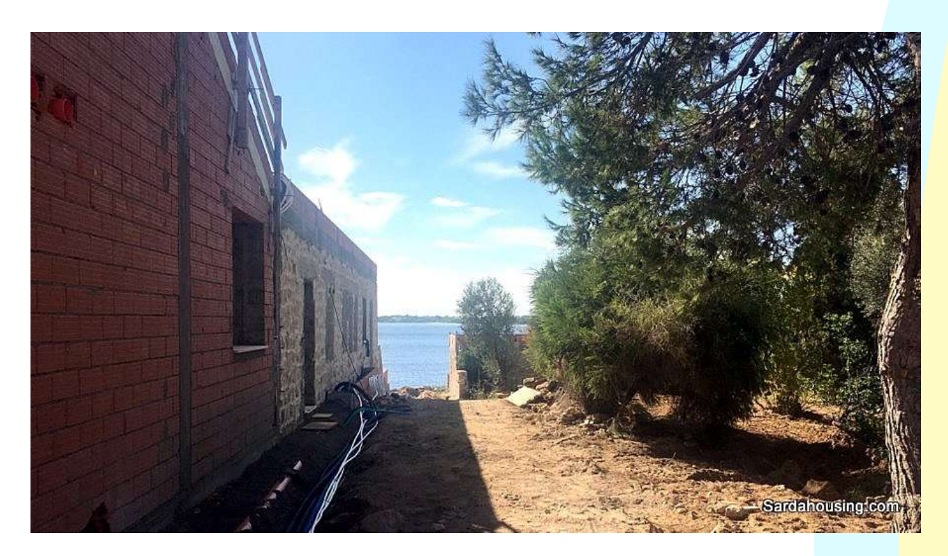
26 - Carloforte – Isola S. Pietro – Le Colonie seafront complex