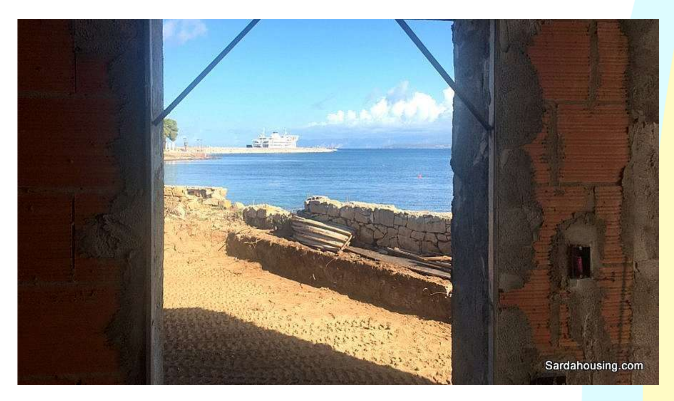
22 - Carloforte – Isola S. Pietro – Le Colonie seafront complex