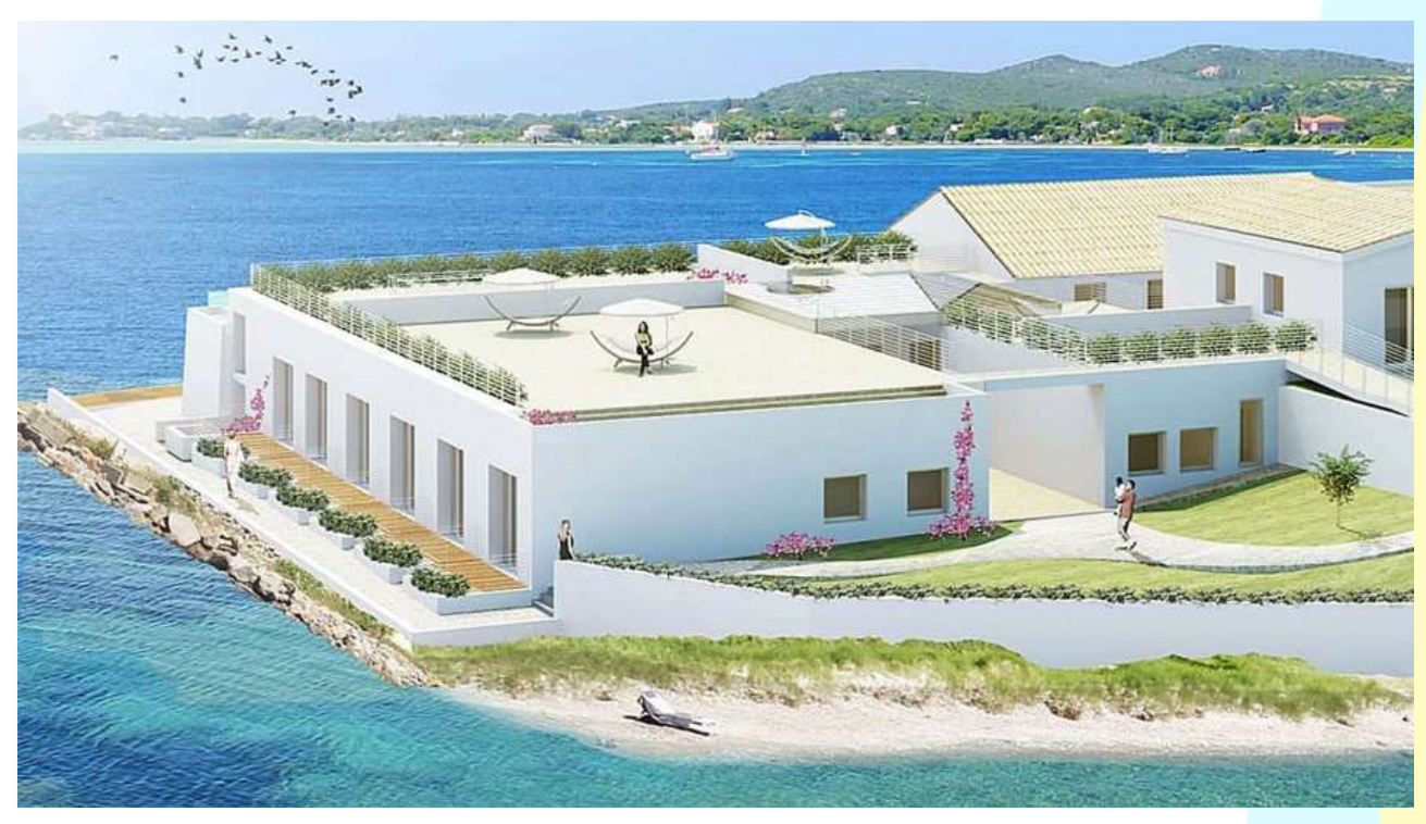
1 – Carloforte – Isola S. Pietro – Complex Le Colonie

In Carloforte, on the Island of San Pietro in Sardinia, we offer exclusive redeveloped apartment 20 metres to the sea in a magnificent complex of buildings by the sea.