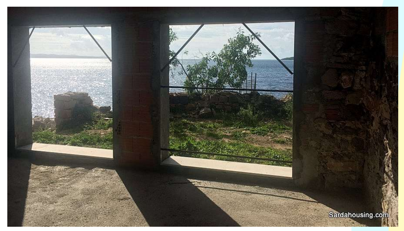
18 - Carloforte – Isola S. Pietro – Le Colonie seafront complex