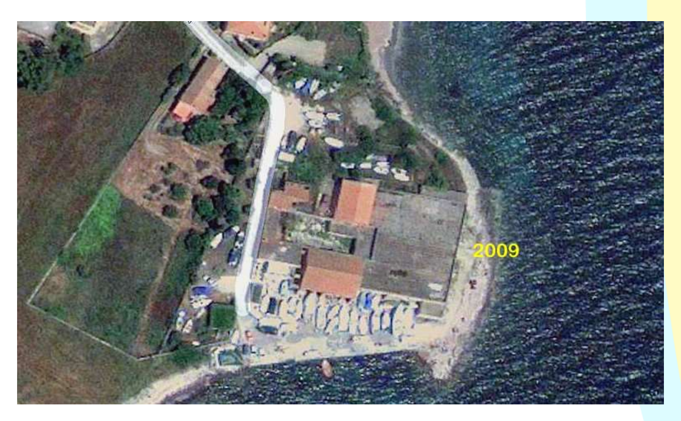
27 - Carloforte – Isola S. Pietro – Le Colonie seafront complex