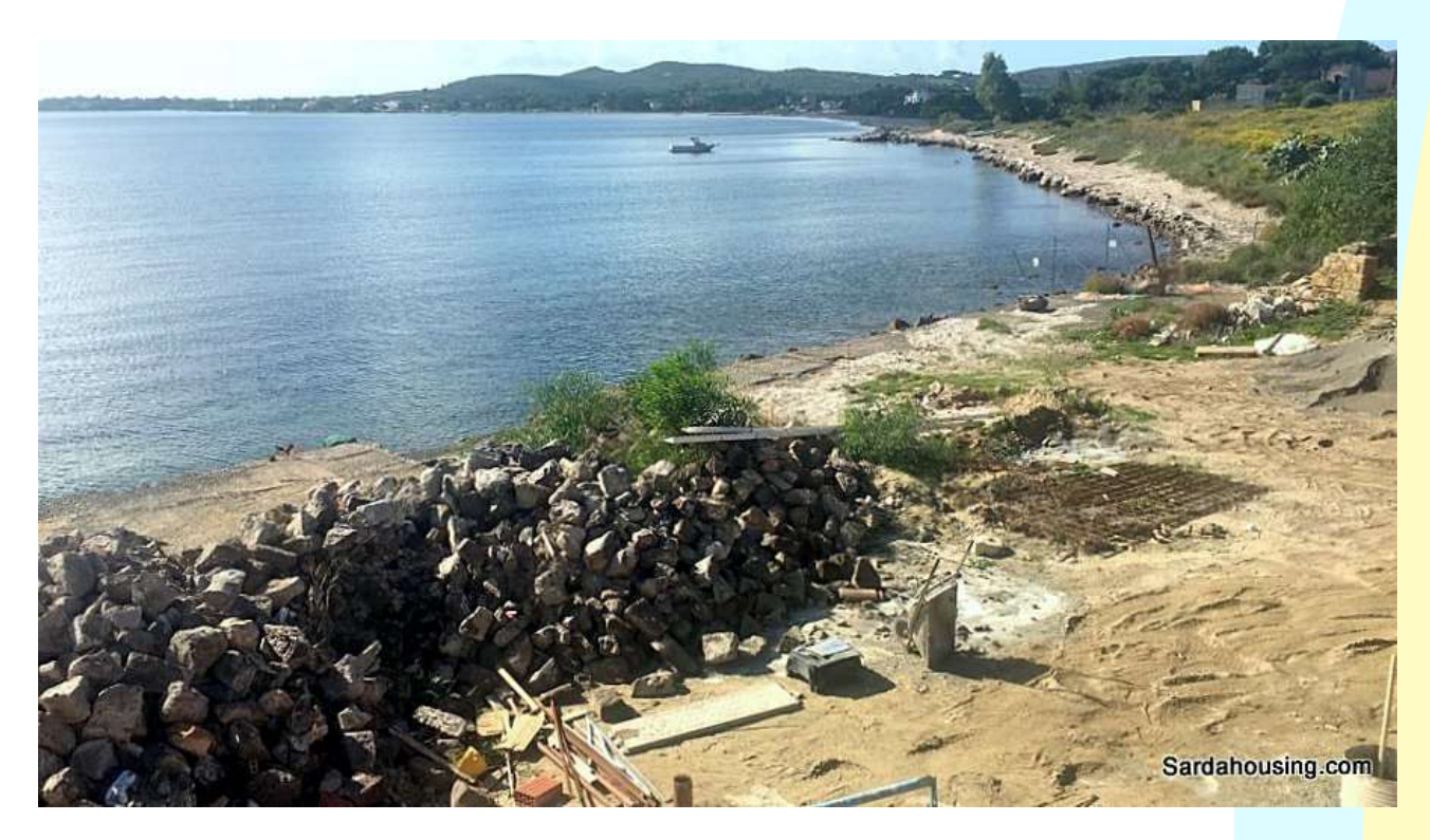
24 - Carloforte – Isola S. Pietro – Le Colonie seafront complex