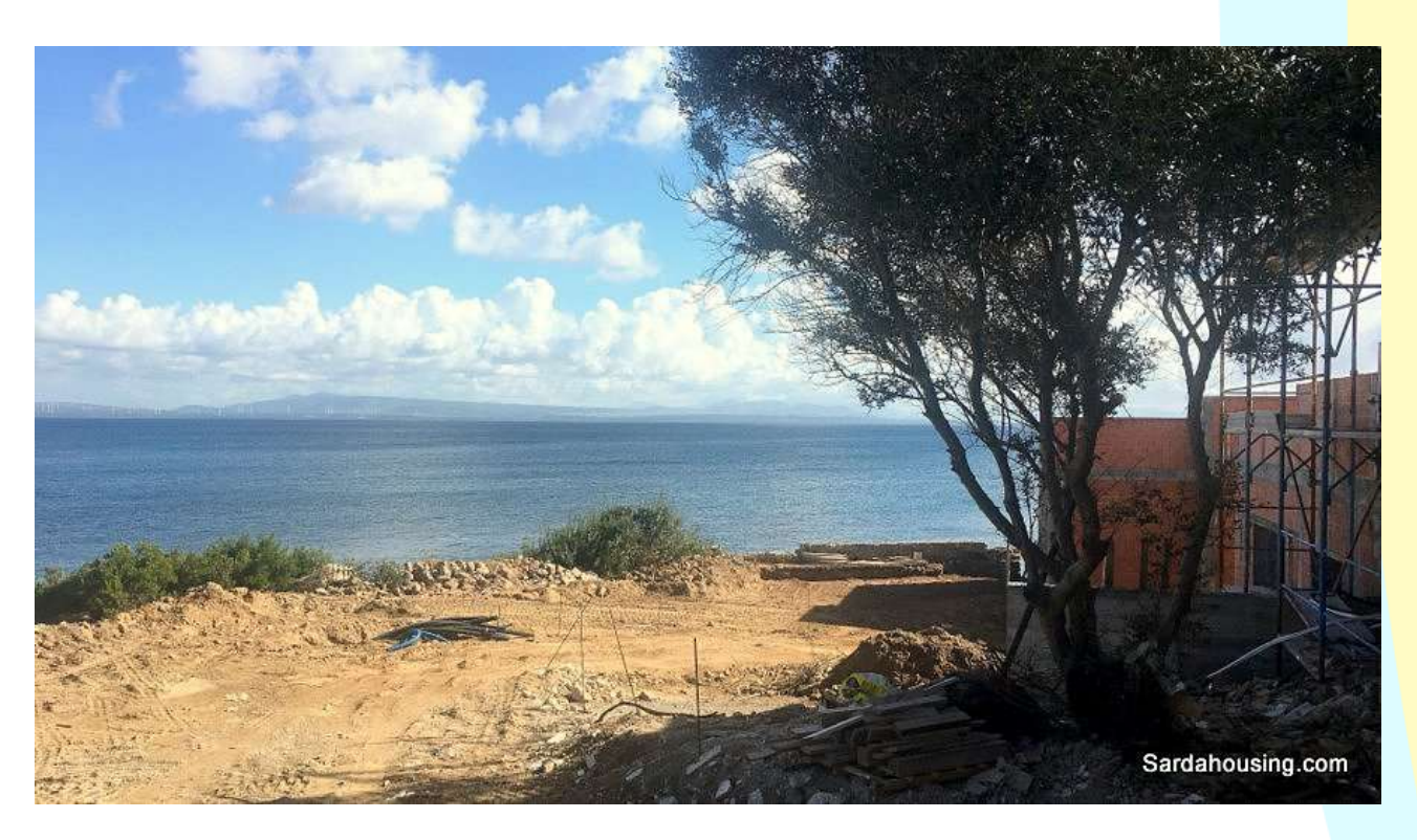
25 - Carloforte – Isola S. Pietro – Le Colonie seafront complex