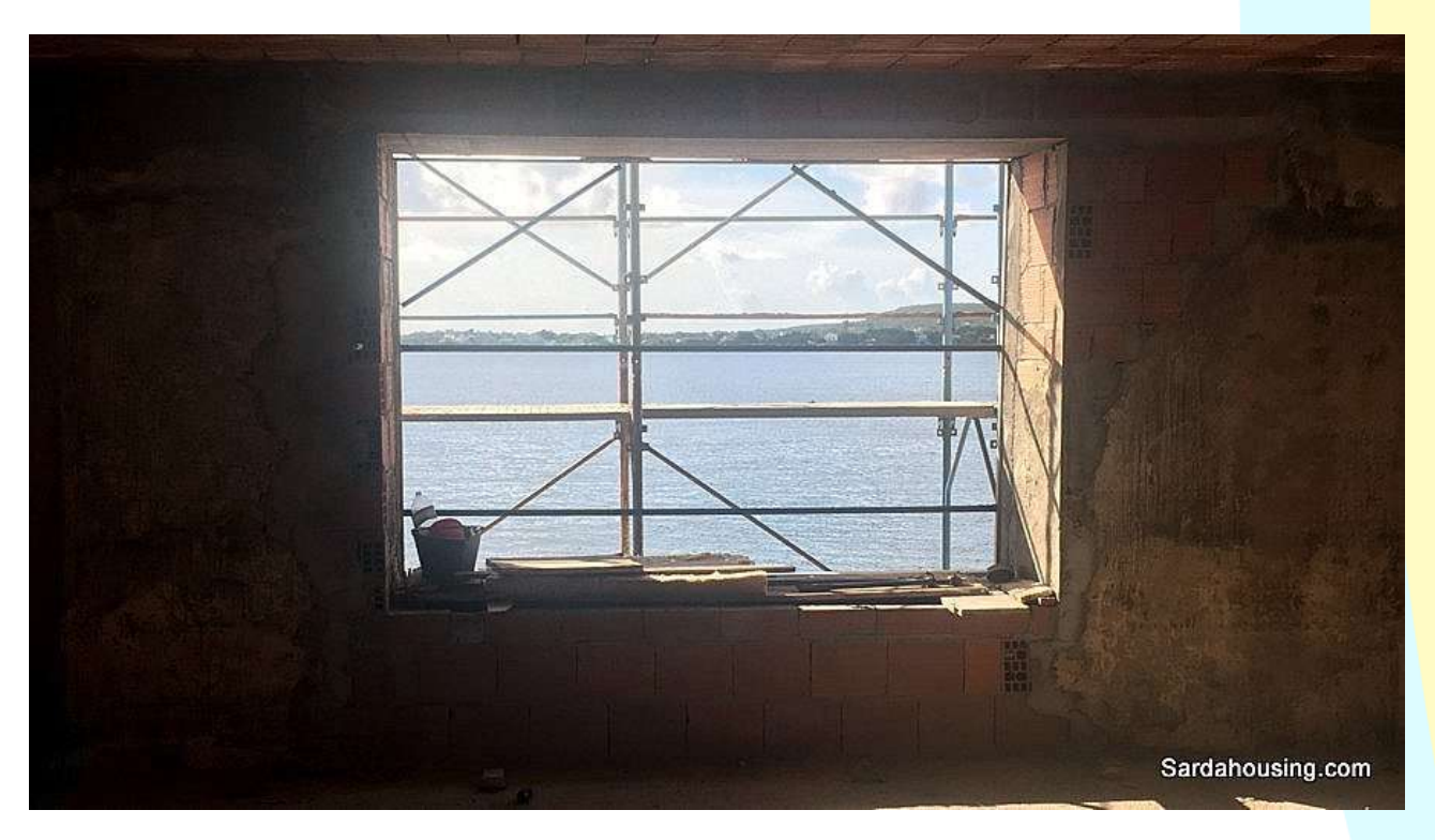
21 - Carloforte – Isola S. Pietro – Le Colonie seafront complex