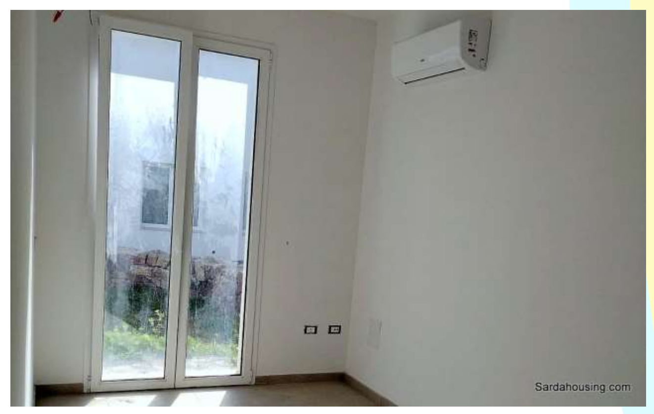
9 - Carloforte – Isola S. Pietro – Apartment Le Colonie