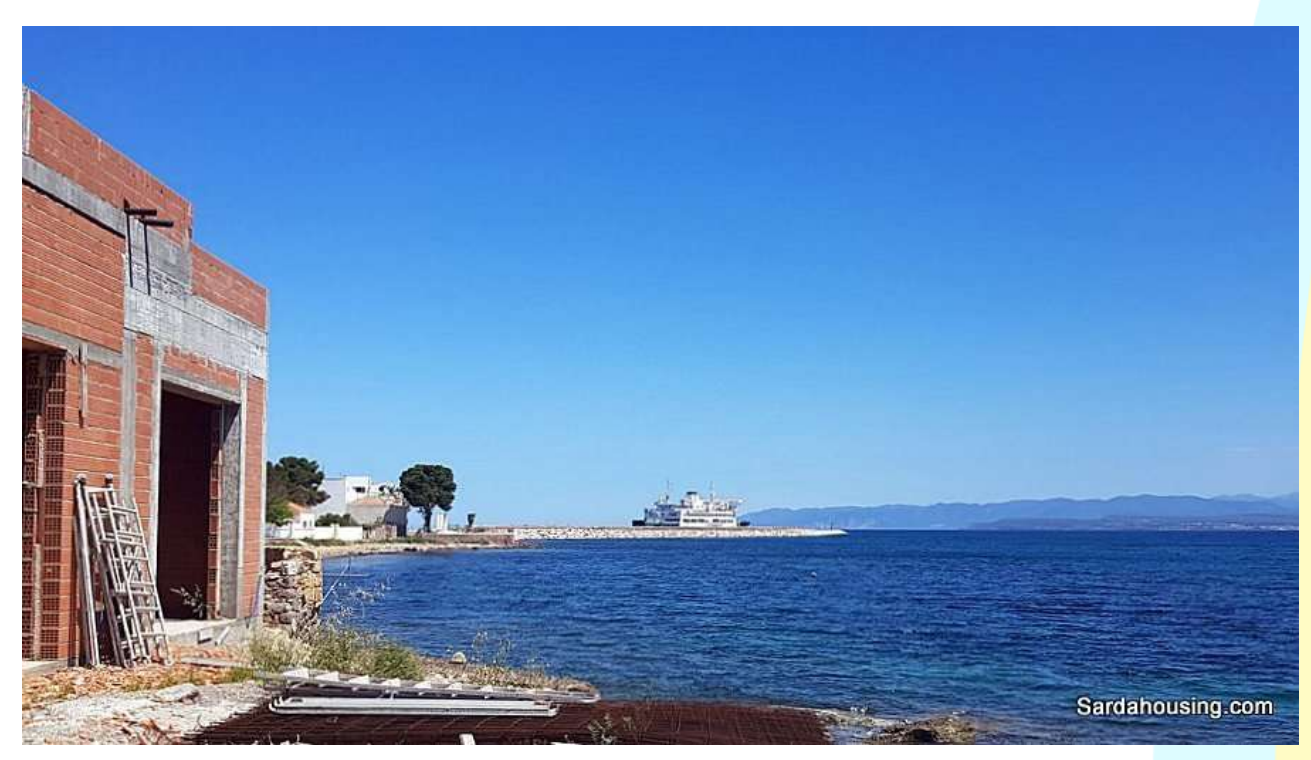
16 - Carloforte – Isola S. Pietro – Le Colonie seafront complex