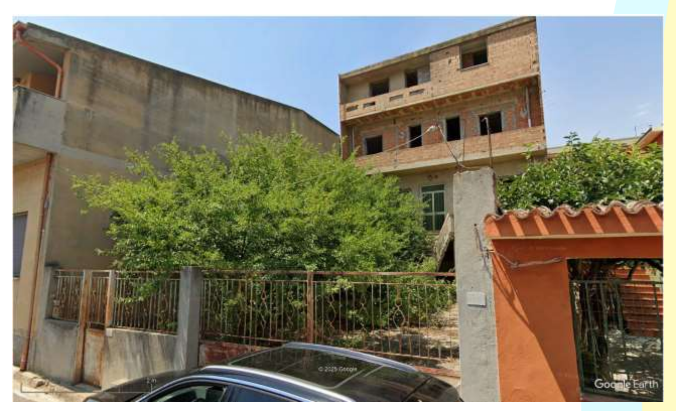
1 - Soleminis - Cagliari - Apartment Nobile on the mezzanine floor

In Soleminis, 15 km to Cagliari, we offer an independent apartment with garden, to be renovated.