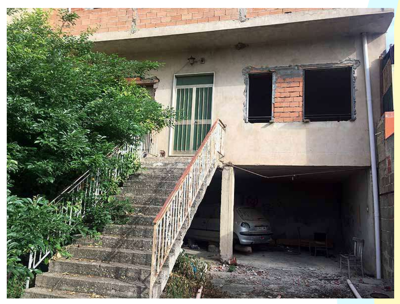
3 - Soleminis - Appartamento Nobile