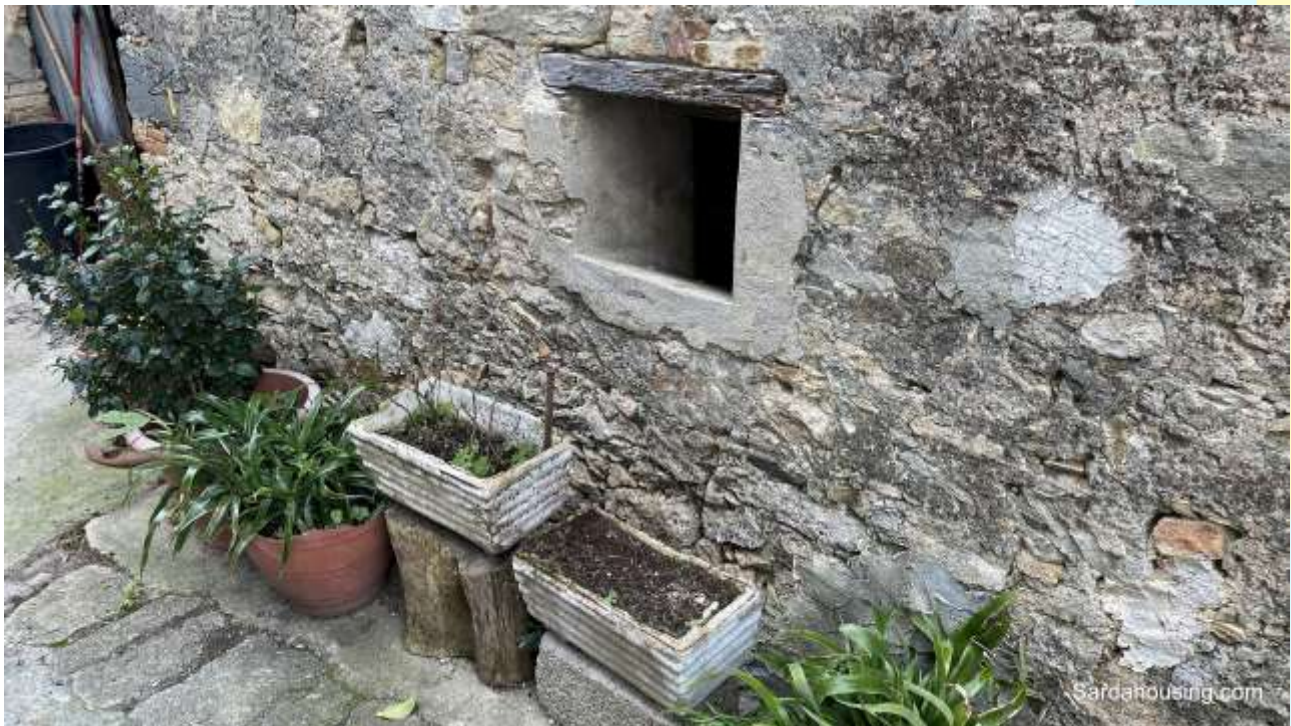
28 - Soleminis – Cagliari – House Roma – details of cellar wall