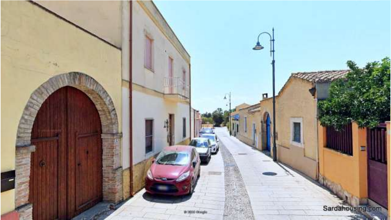
2 - Soleminis – Cagliari – House Roma