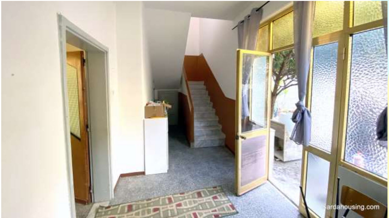
9 - Soleminis – Cagliari – House Roma – veranda onto the courtyard