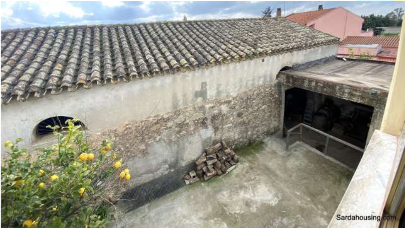
20 - Soleminis – Cagliari – House Roma – courtyard and internal entrance to the cellar