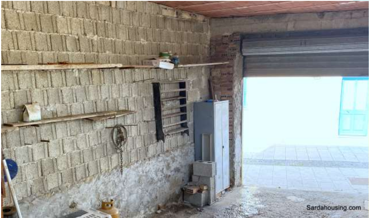
27 - Soleminis – Cagliari – House Roma – porticoed driveway