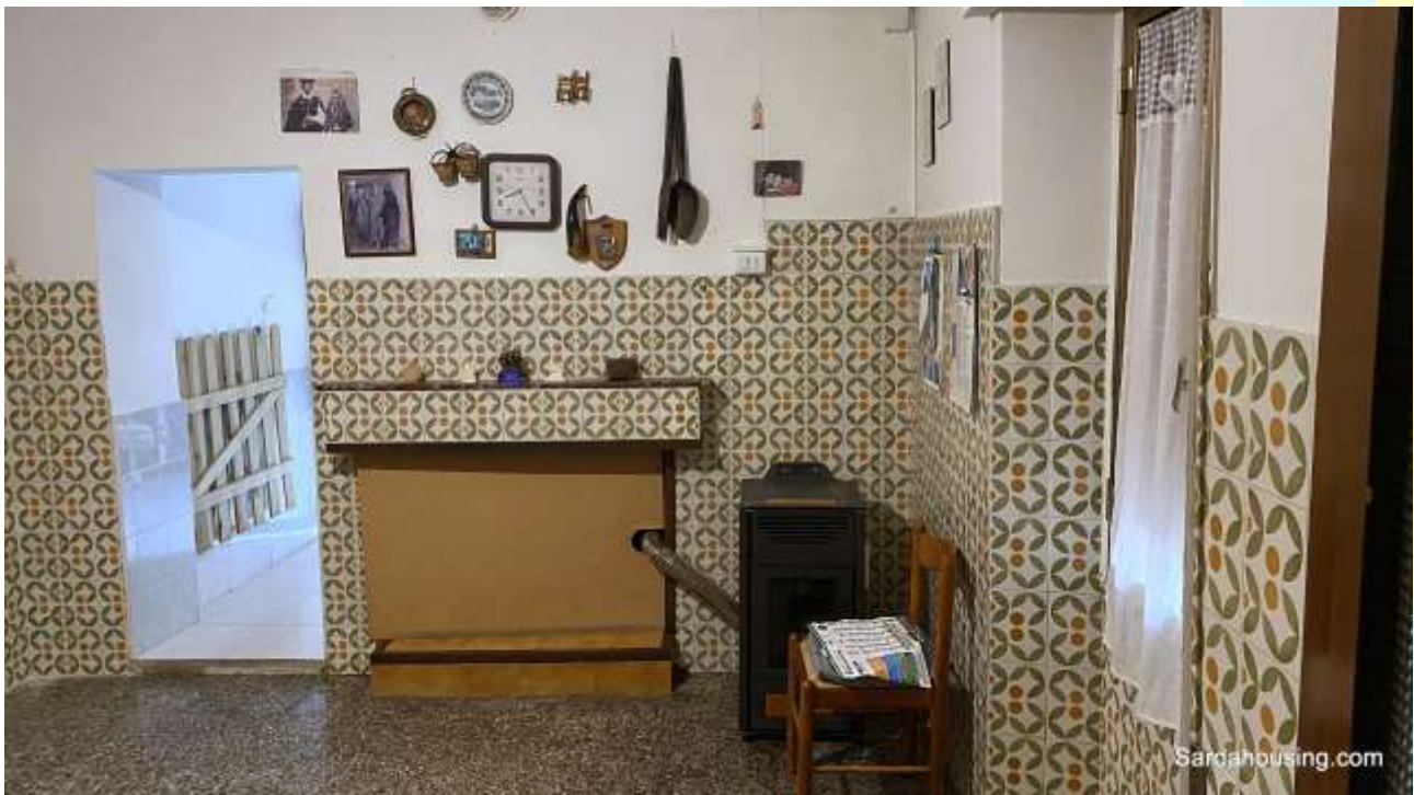
6 - Soleminis – Cagliari – House Roma - fireplace