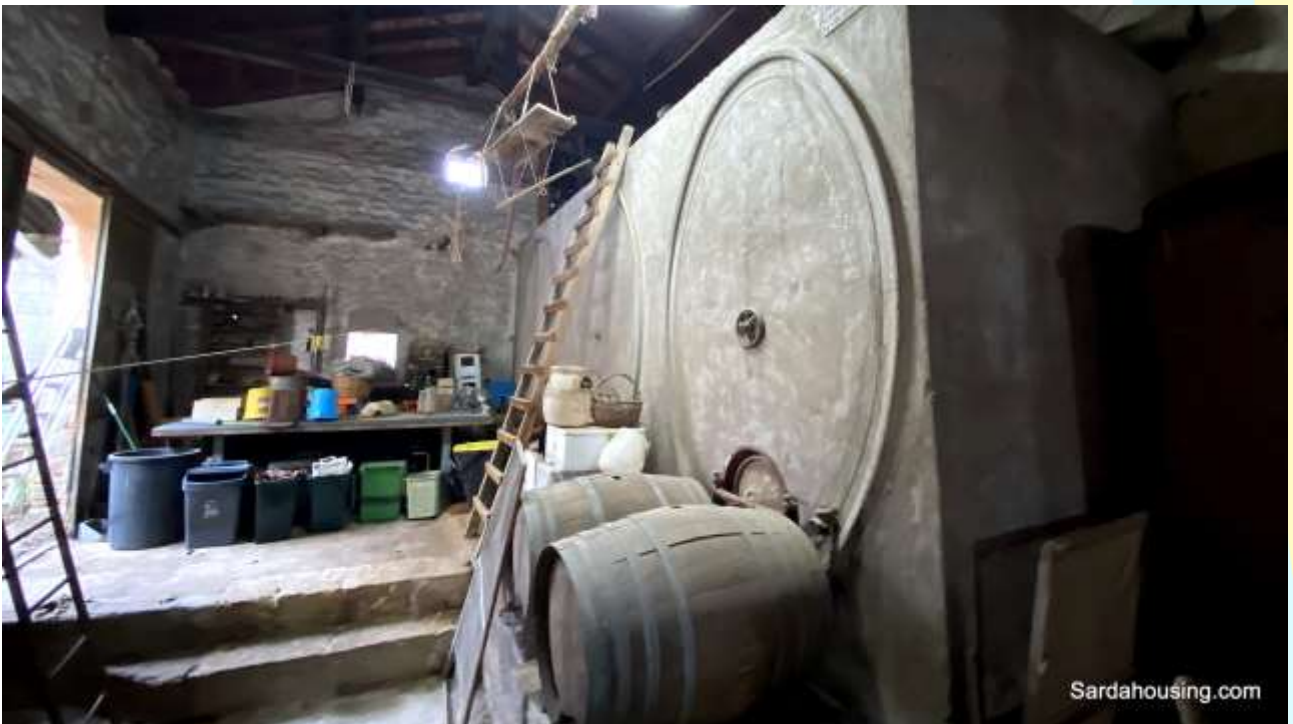
24 - Soleminis – Cagliari – House Roma – concrete barrels