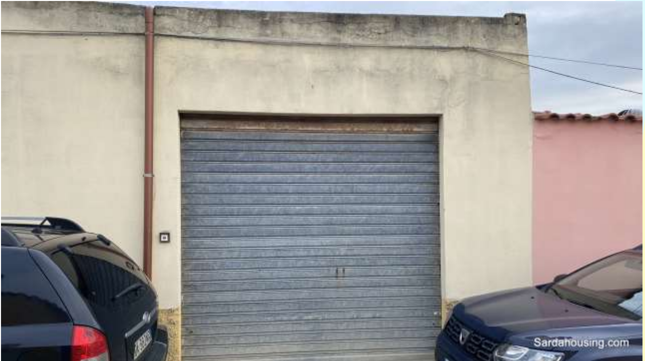
3 - Soleminis - Cagliari - House Roma - drivable entrance