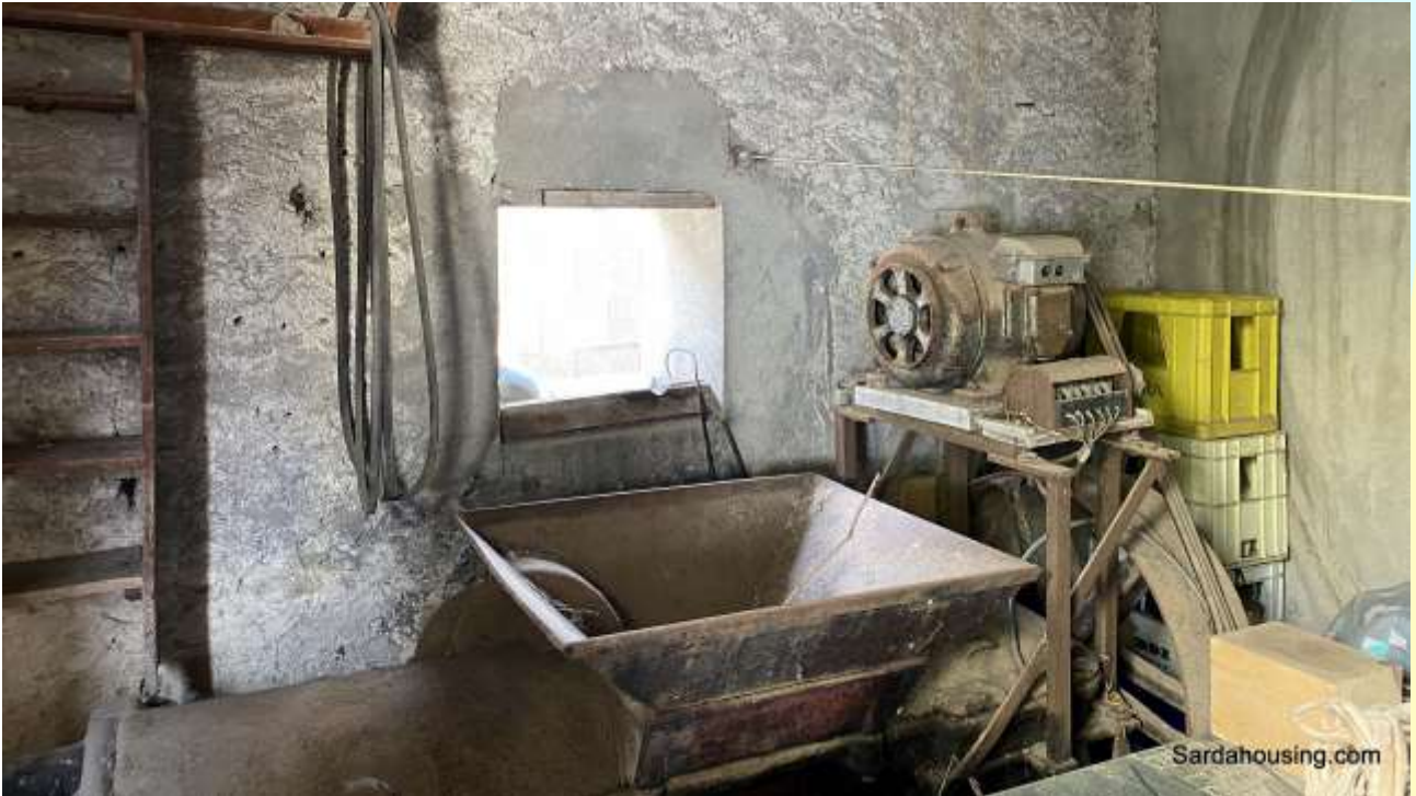
25 - Soleminis – Cagliari – House Roma – grape press in the cellar