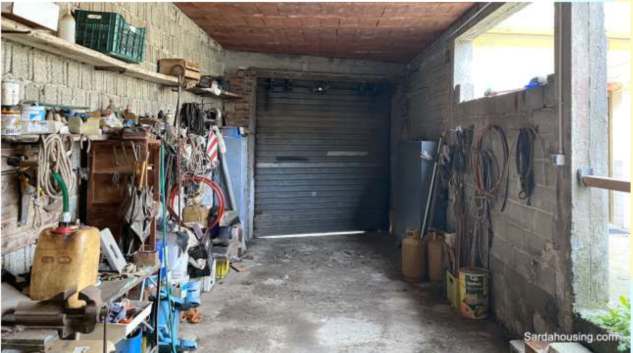
26 - Soleminis – Cagliari – House Roma – porticoed drive way