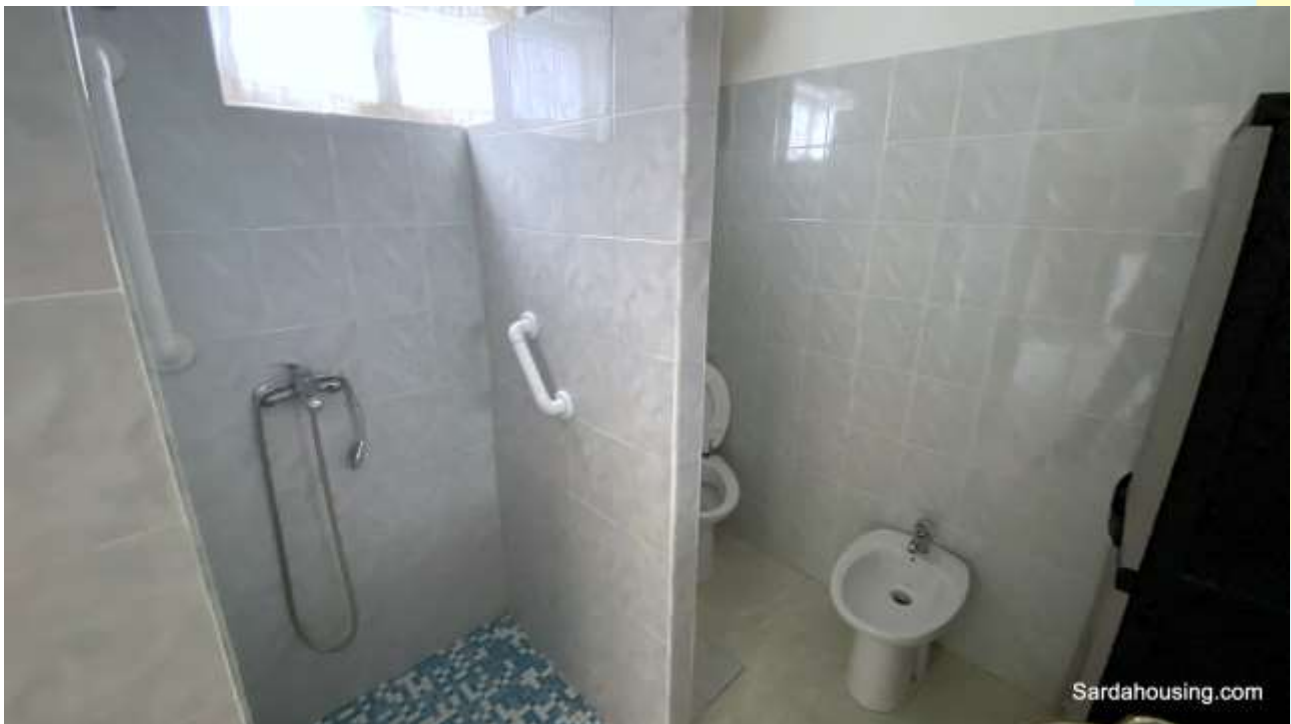
12 - Soleminis – Cagliari – House Roma – ground floor bathroom