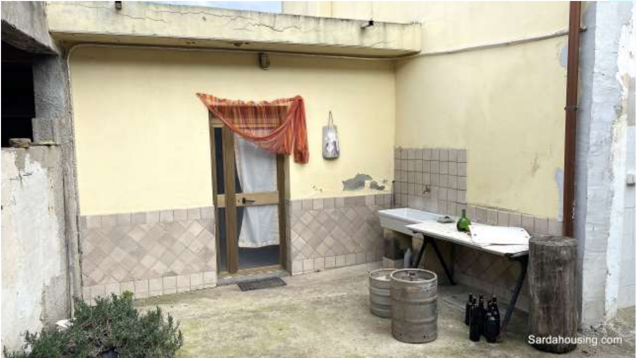
19 - Soleminis – Cagliari – House Roma - courtyard