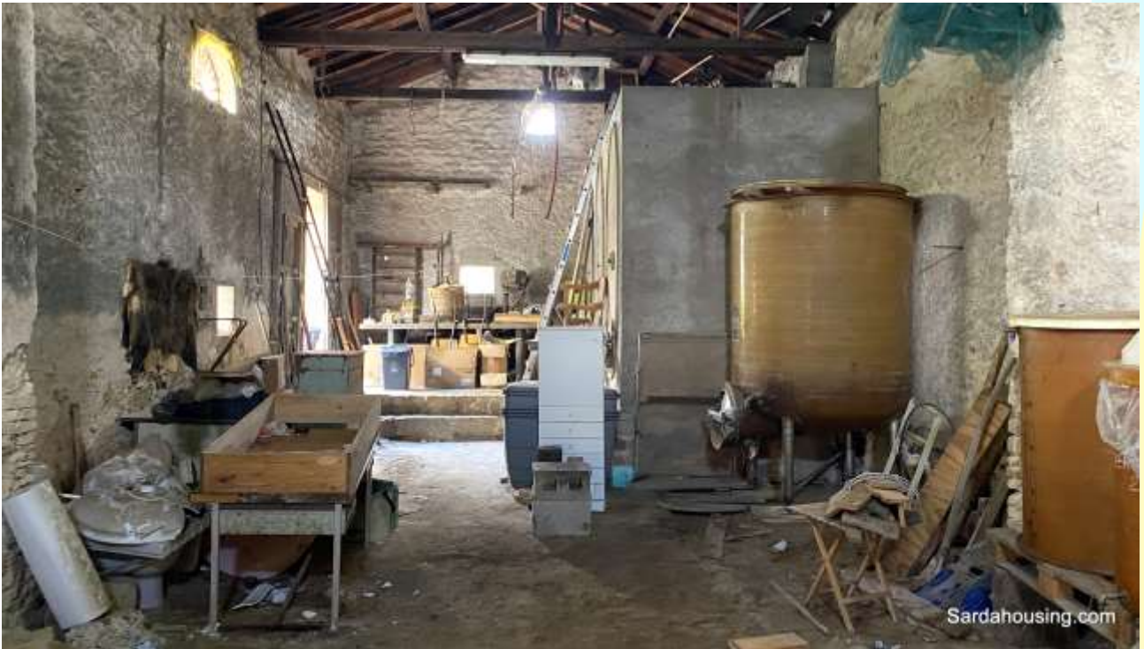
23 - Soleminis – Cagliari – House Roma – cellar interiors