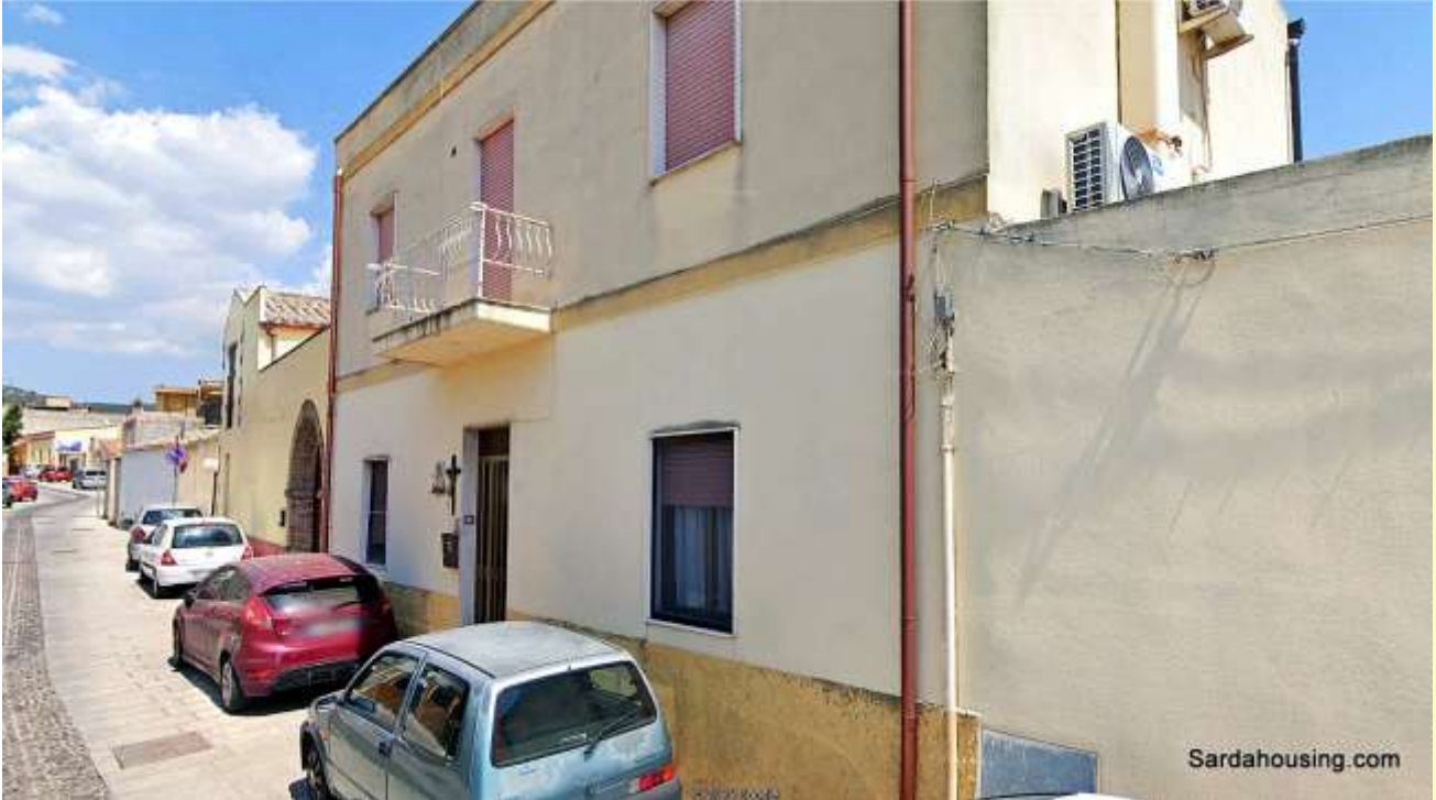
1 – Soleminis – Cagliari – House Roma

In Soleminis , a quiet village in Parteolla 15 km to Cagliari , we offer a detached house in the old centre , with cellar and courtyard .