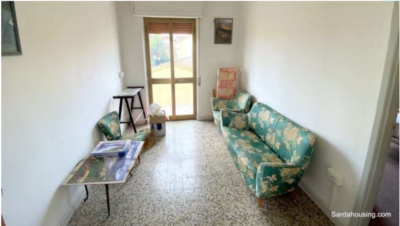
15 - Soleminis – Cagliari – House Roma – upper floor