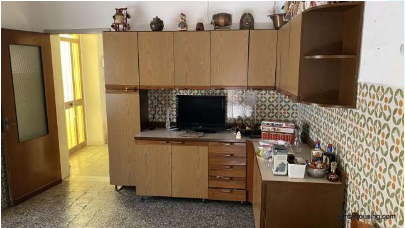
5 - Soleminis – Cagliari – House Roma - kitchen