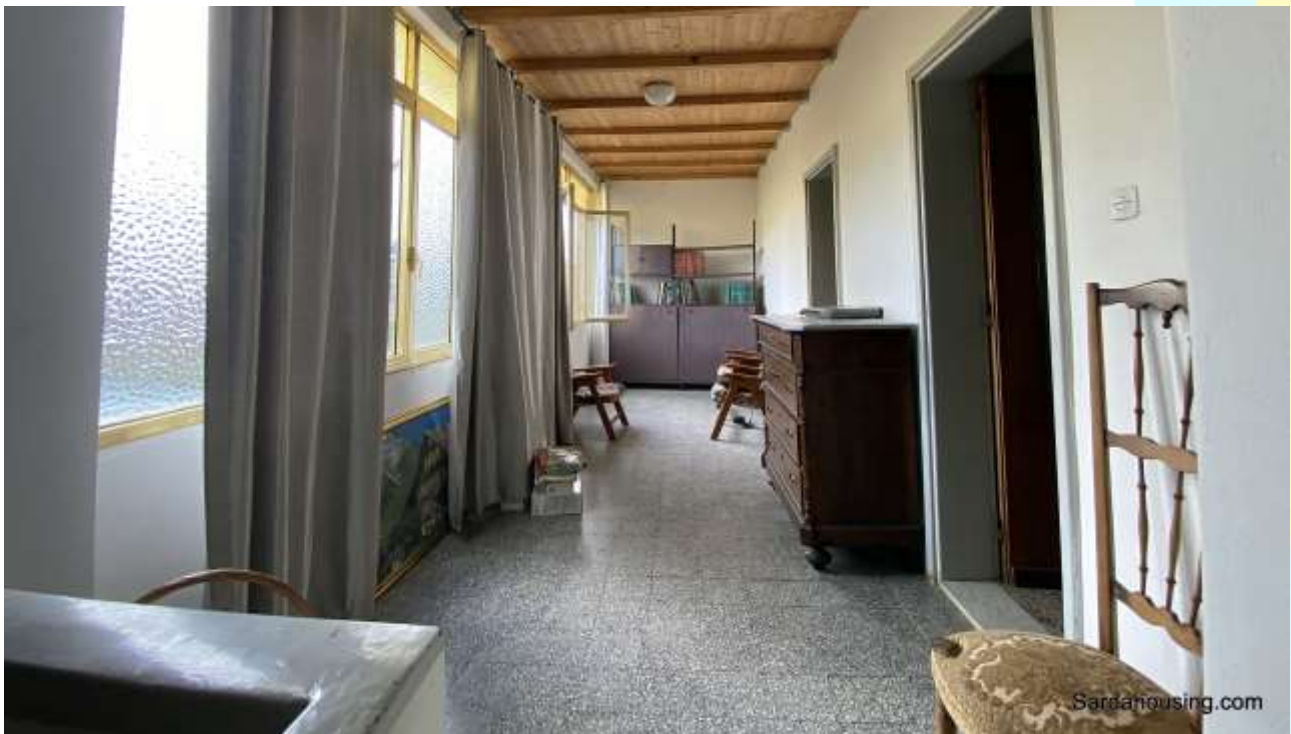
14 - Soleminis – Cagliari – House Roma – upper corridor