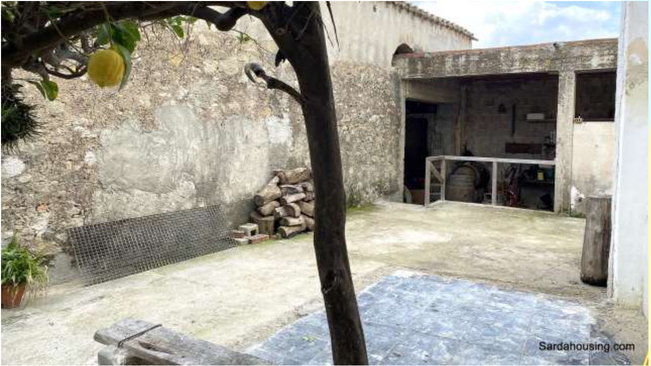
21 - Soleminis – Cagliari – House Roma – cellar entrance