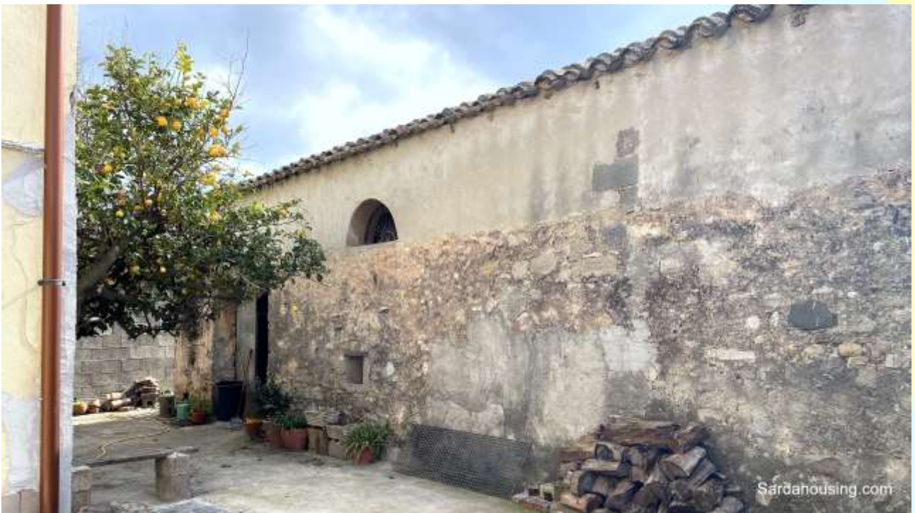
22 - Soleminis – Cagliari – House Roma – stone and brick cellar from outside