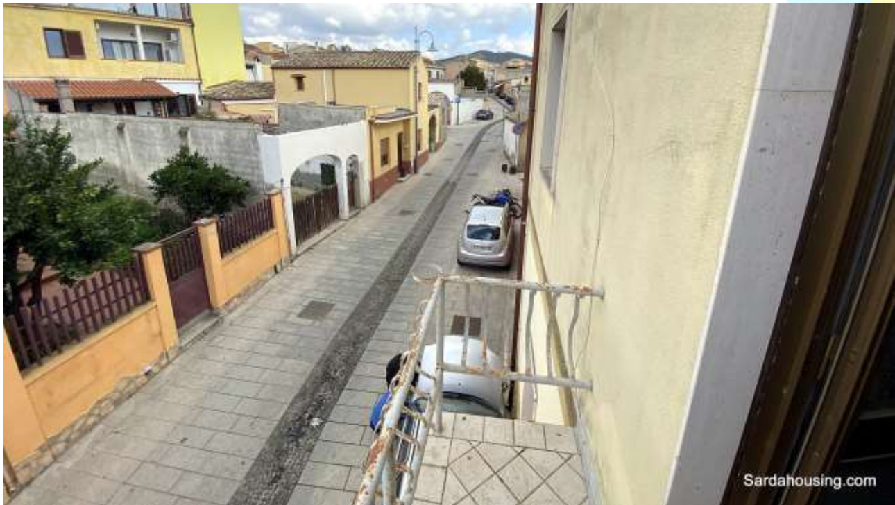
16 - Soleminis – Cagliari – House Roma – a view from balcony