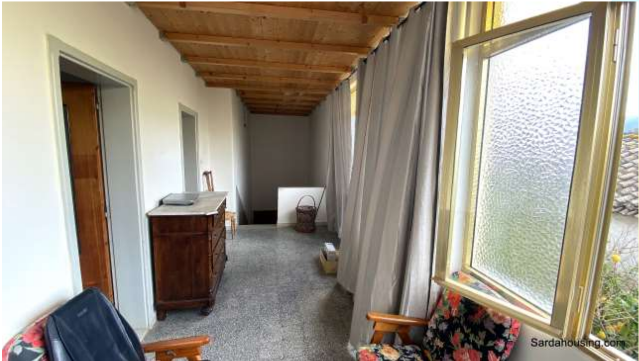
13 - - Soleminis – Cagliari – House Roma – upper corridor and stairs