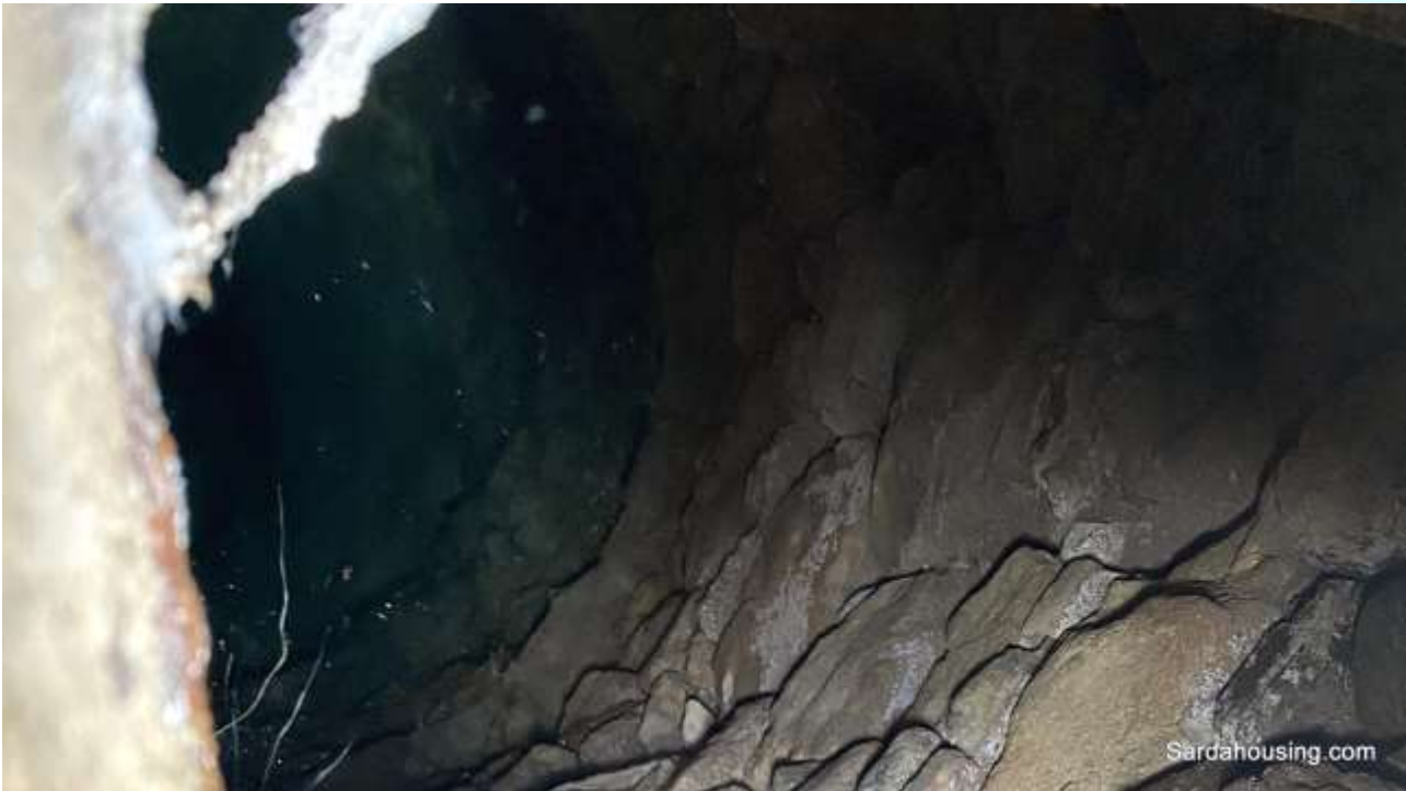
29 - Soleminis – Cagliari – House Roma – still active artesian well