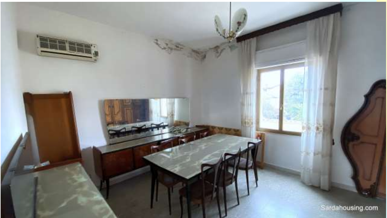
8 - Soleminis – Cagliari – House Roma – dining room