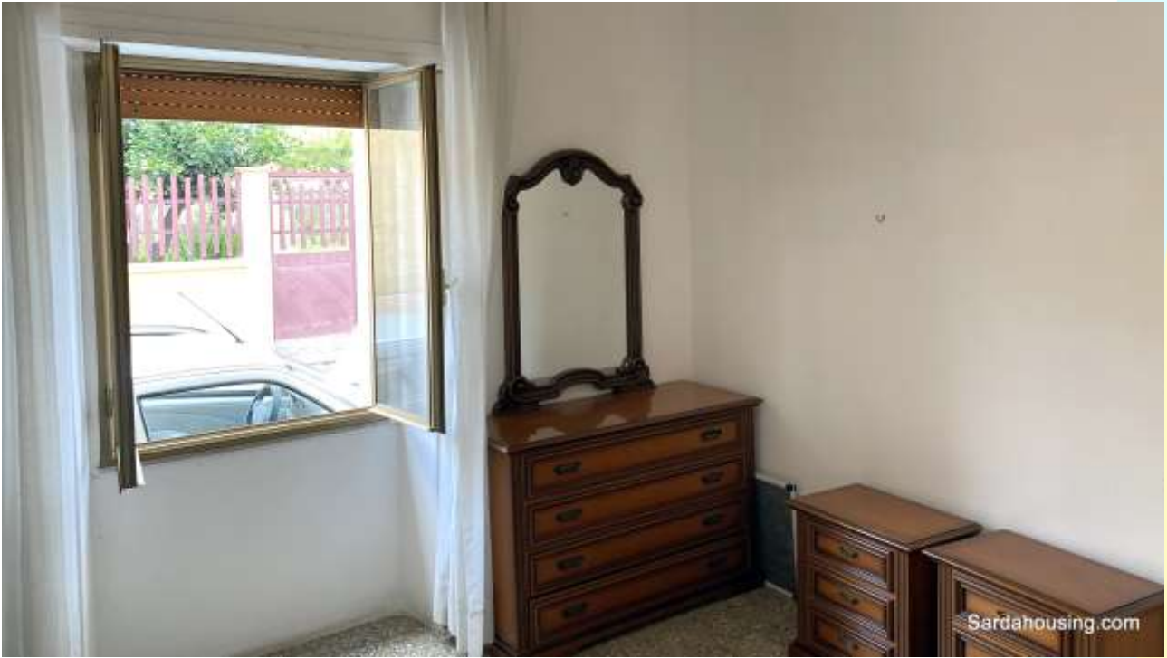
7 - Soleminis – Cagliari – House Roma - bedroom