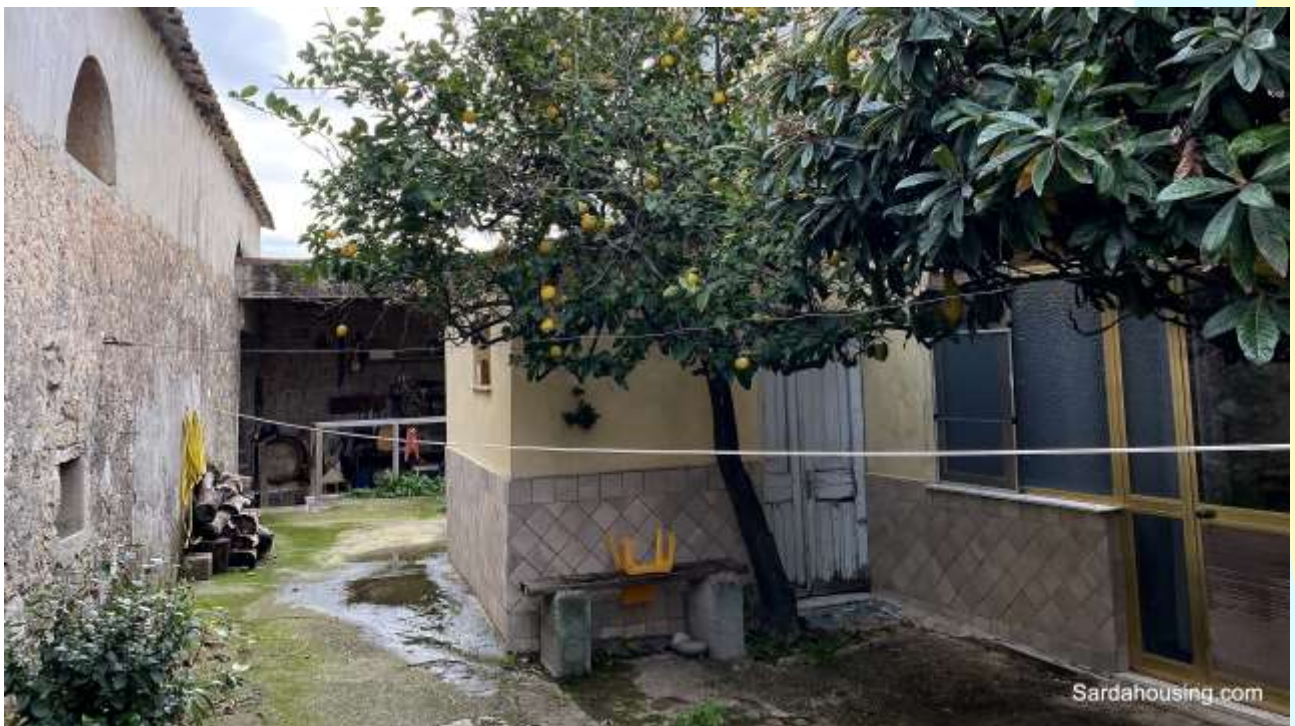
10 - Soleminis – Cagliari – House Roma - courtyard