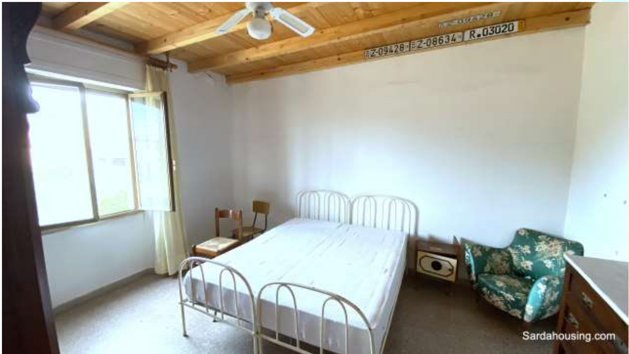
17 - Soleminis – Cagliari – House Roma – bedroom on the upper floor