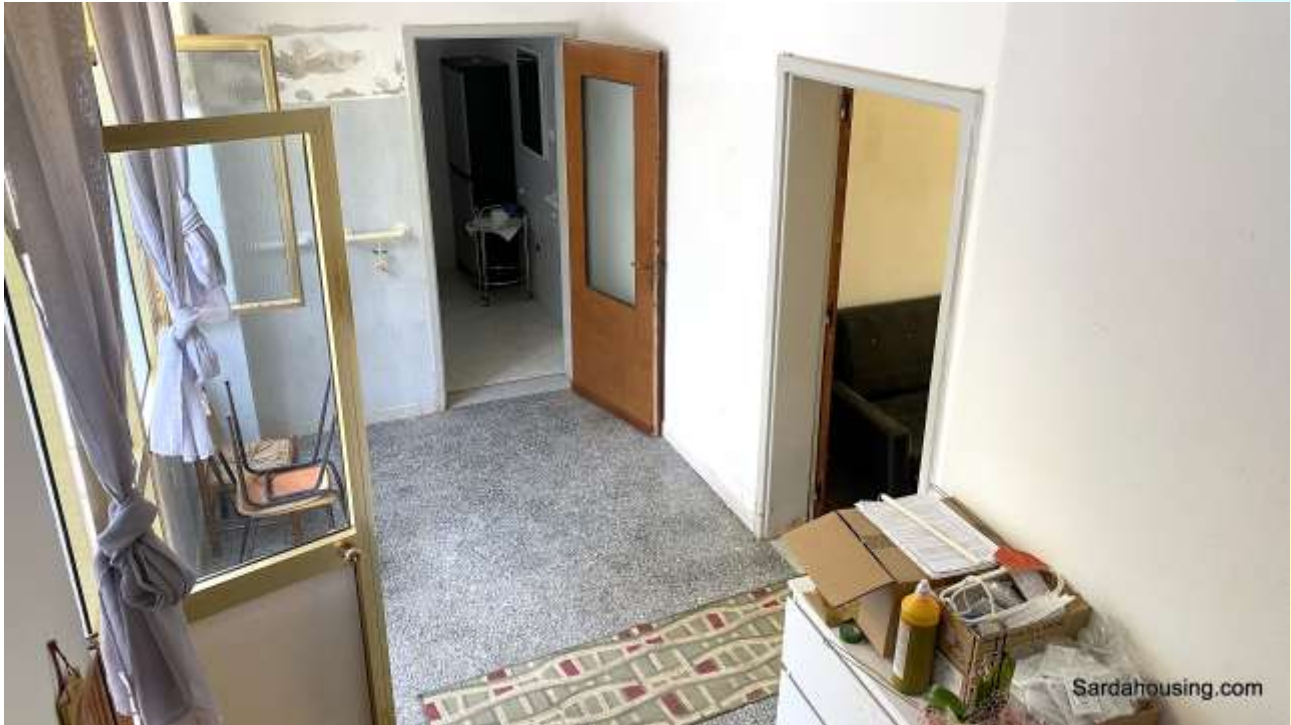
11 - Soleminis – Cagliari – House Roma – veranda and bathroom entrance