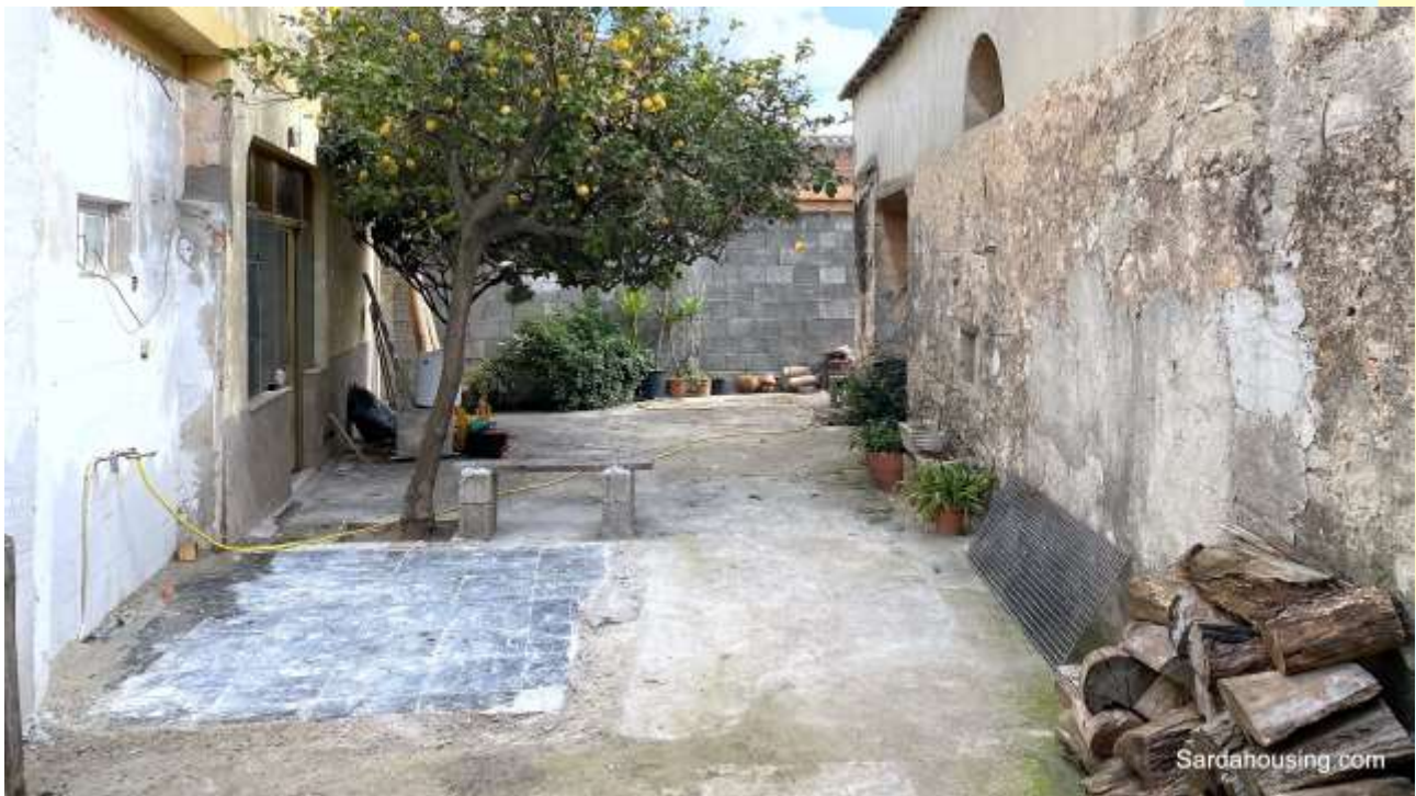
18 - Soleminis – Cagliari – House Roma – courtyard and cellar facing the house