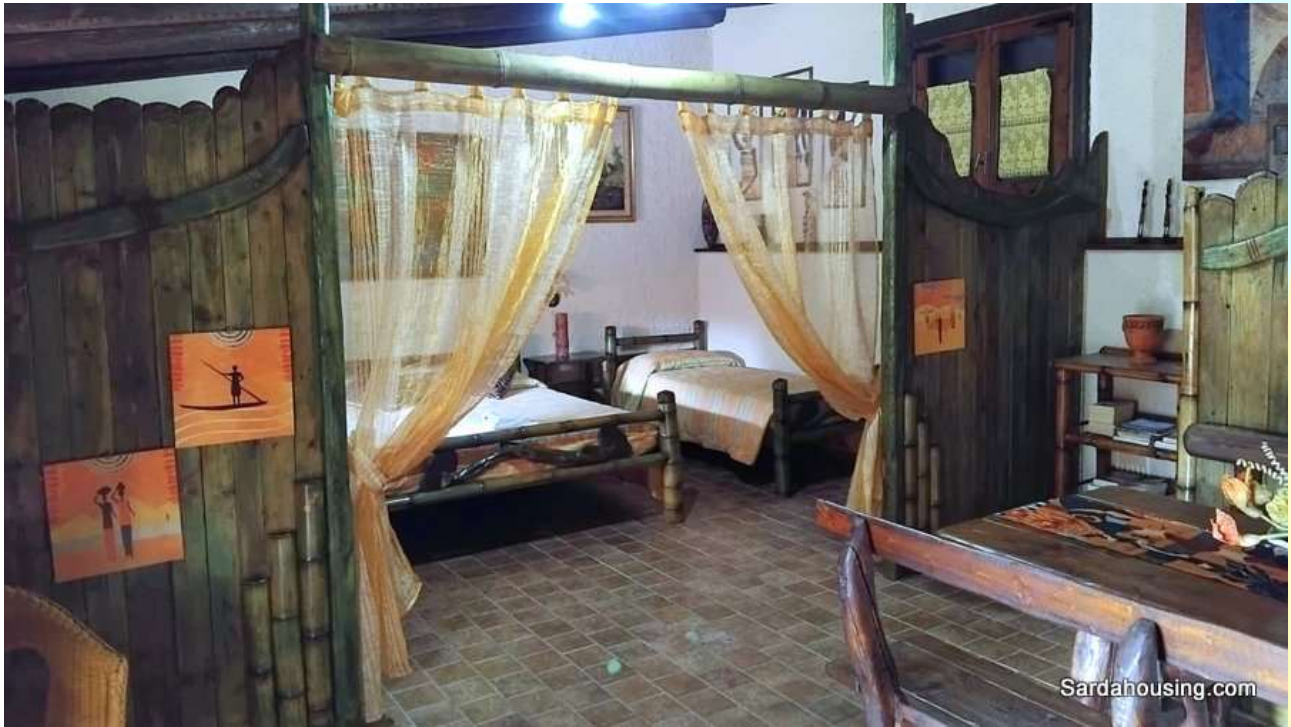
14 - Scivu – Villa Fantasy – interiors