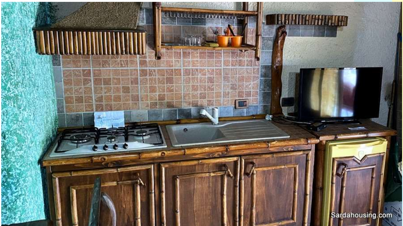
15 - Scivu – Villa Fantasy – interiors