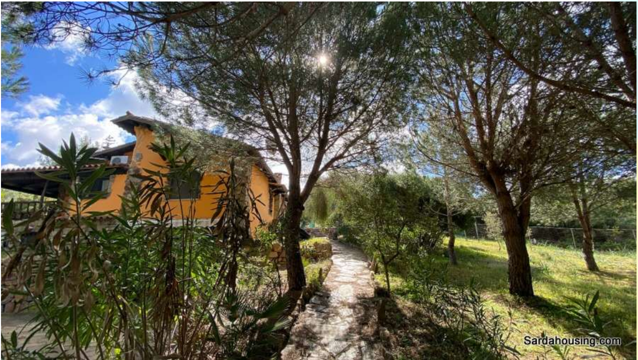
12 - Scivu – Villa Fantasy