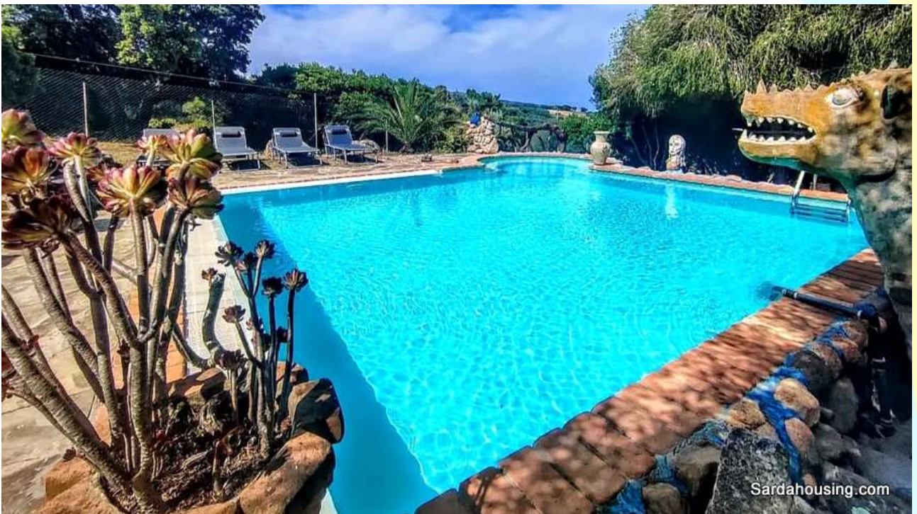
17 - Scivu – Villa Fantasy – swimming pool with hydro massage