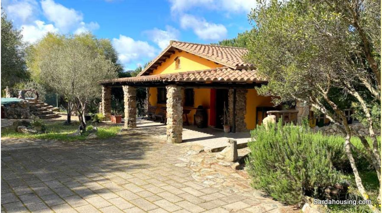
1 – Scivu – Villa Fantasy

In Scivu , on the south-western coast of Sardinia , we offer a one-of-a-kind villa that is perfectly integrated into the unpolluted environment of the dunes on the beach .