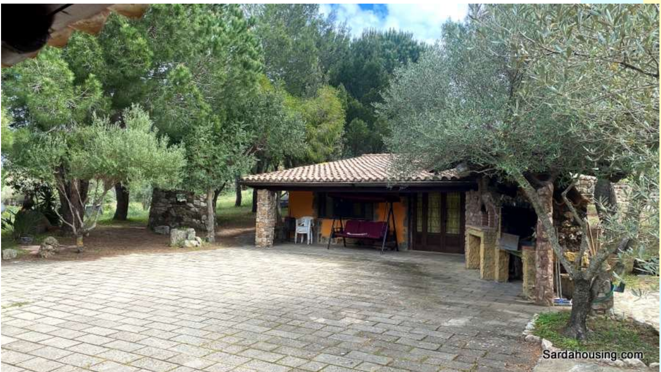
11 - Scivu – Villa Fantasy – independent studio apartment