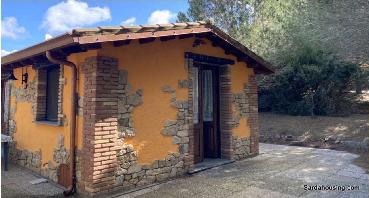
4 – Scivu – Villa Fantasy – independent studio apartment

The second independent studio apartment, 30 sqm (formerly used as the breakfast room), includes a bedroom with bathroom.