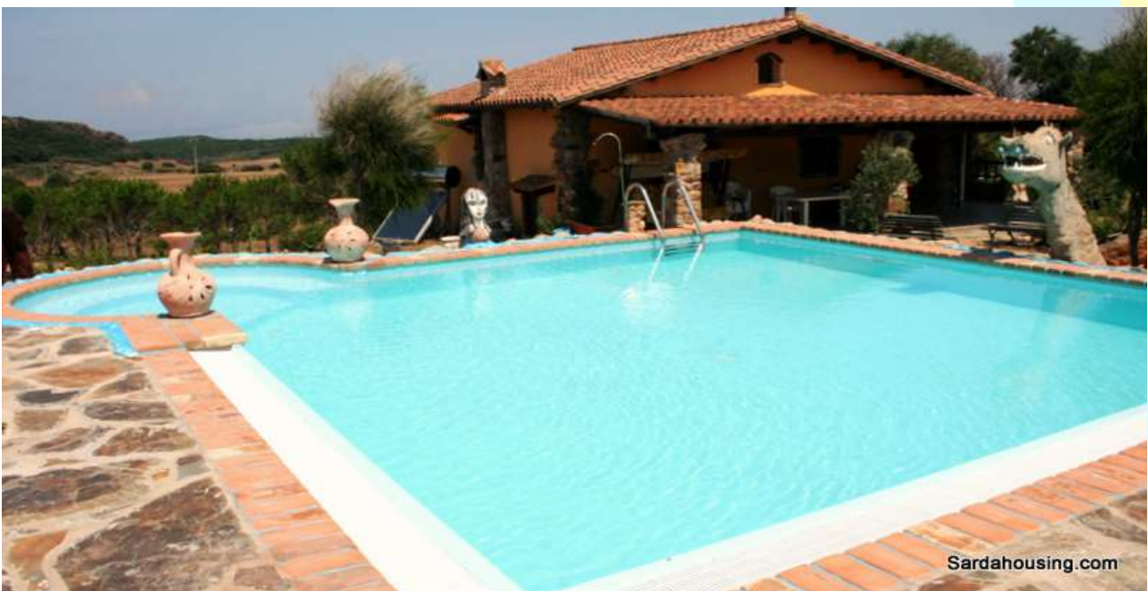
5 – Scivu – Villa Fantasy – swimming pool with hydro massage

Finally, the clay tennis/futsal court , realized above one of the underground tanks, has night lighting .