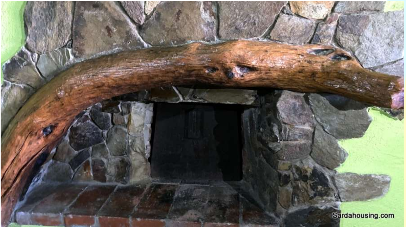
16 - Scivu – Villa Fantasy – Sardinian oven