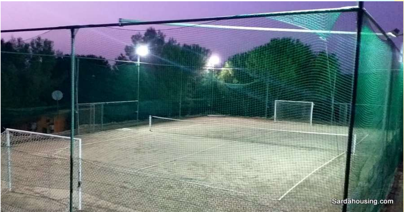
7 – Scivu – Villa Fantasy – clay tennis/futsal court