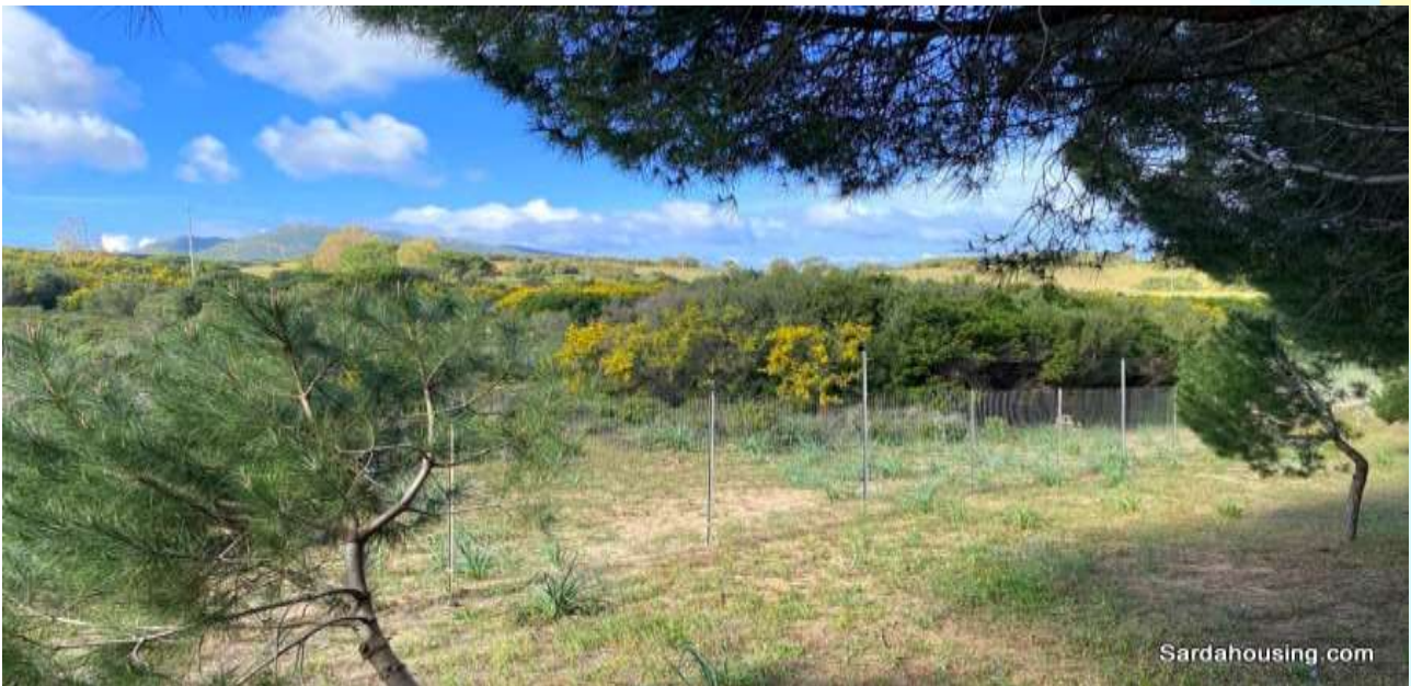
9 - Scivu – Villa Fantasy – a view

info@sardahousing.com - www.sardahousing.com