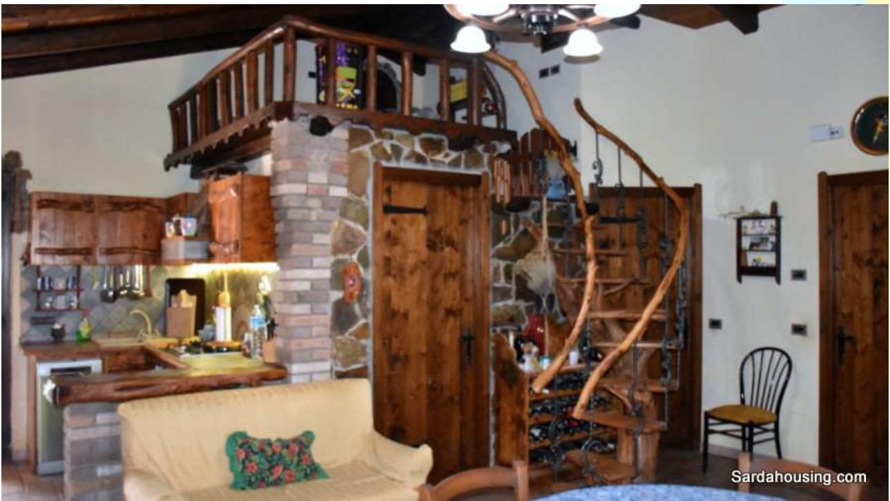
13 - Scivu – Villa Fantasy – interiors