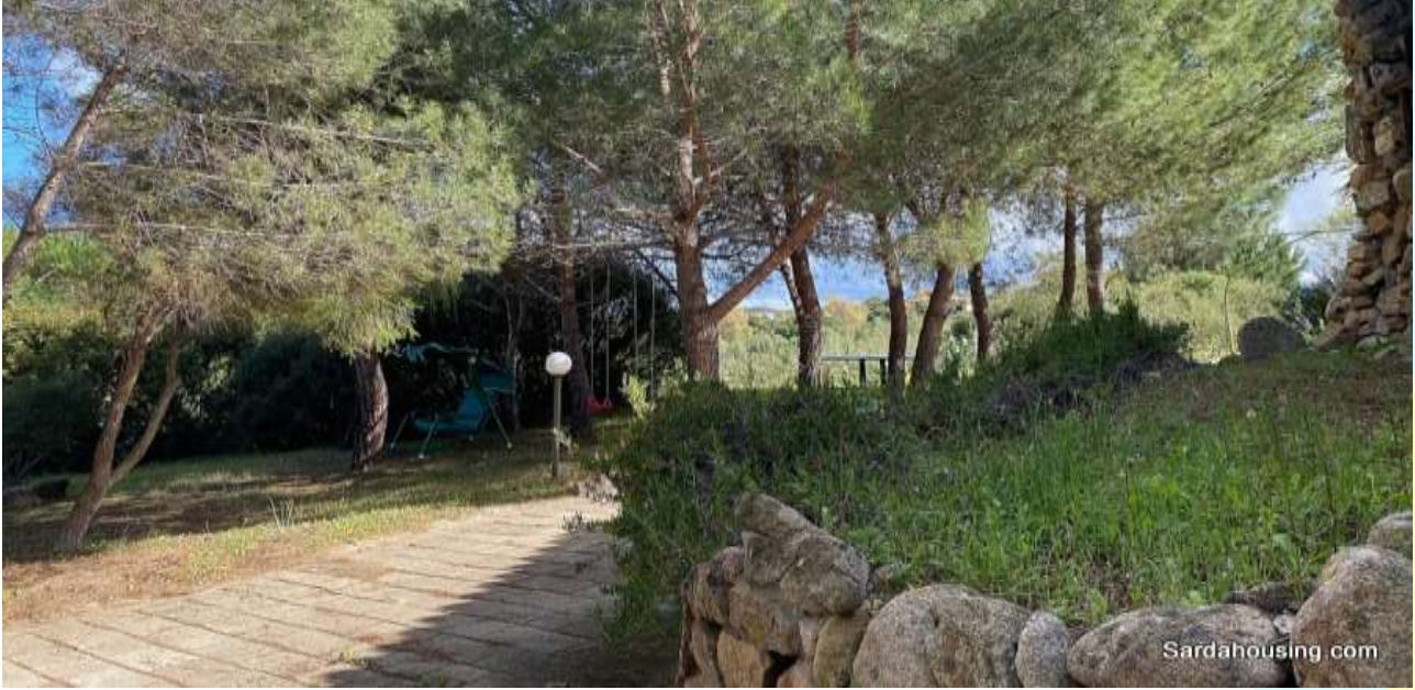
8 – Scivu – Villa Fantasy – in the greenery with all comforts