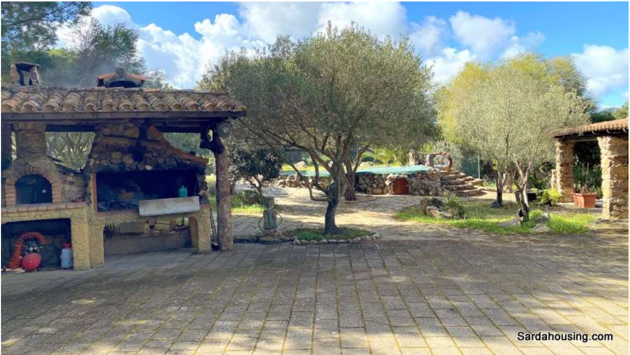
10 - Scivu – Villa Fantasy – BBQ area with Sardinian oven