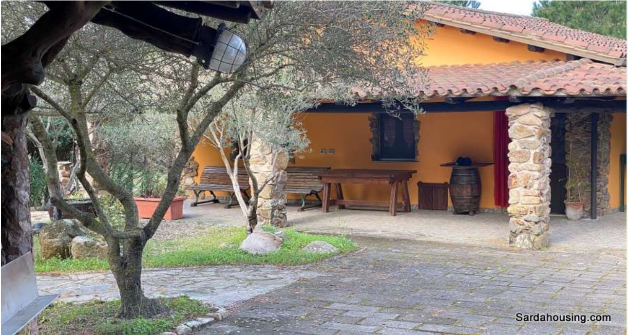
2 – Scivu – Villa Fantasy – large veranda

The creativity of the craftsman/artist is here combined with an infinite series of finishes and construction details that make each single room of the villa unique.