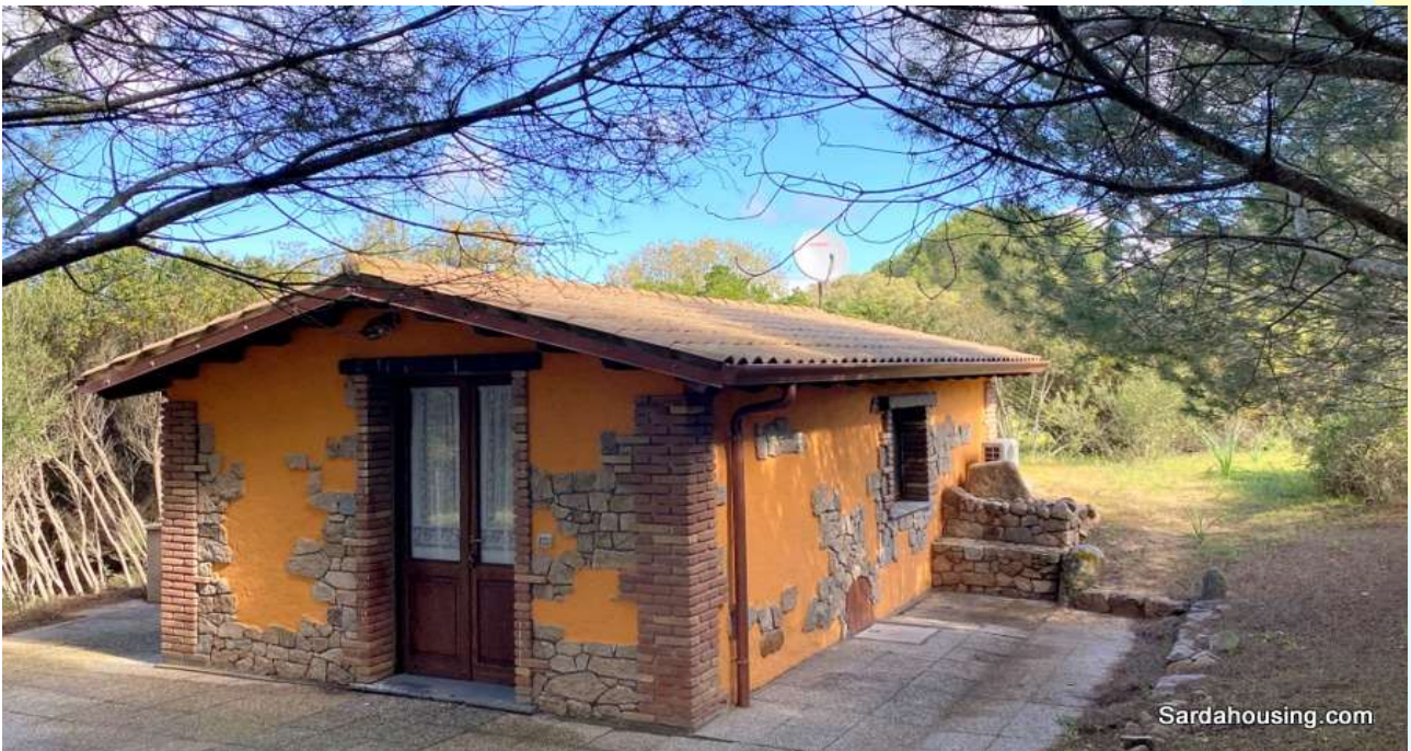
3 – Scivu – Villa Fantasy – independent studio apartment

In front of the veranda of the villa, we find the first independent studio apartment, 48 sqm , consisting of a double bedroom, a kitchenette, a bathroom and a large veranda on the front.