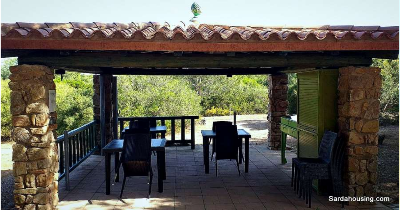
6 – Scivu – Villa Fantasy – brik gazebo